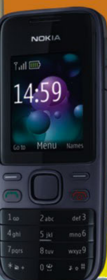
Nokia 2690 MRP BDT 4,495