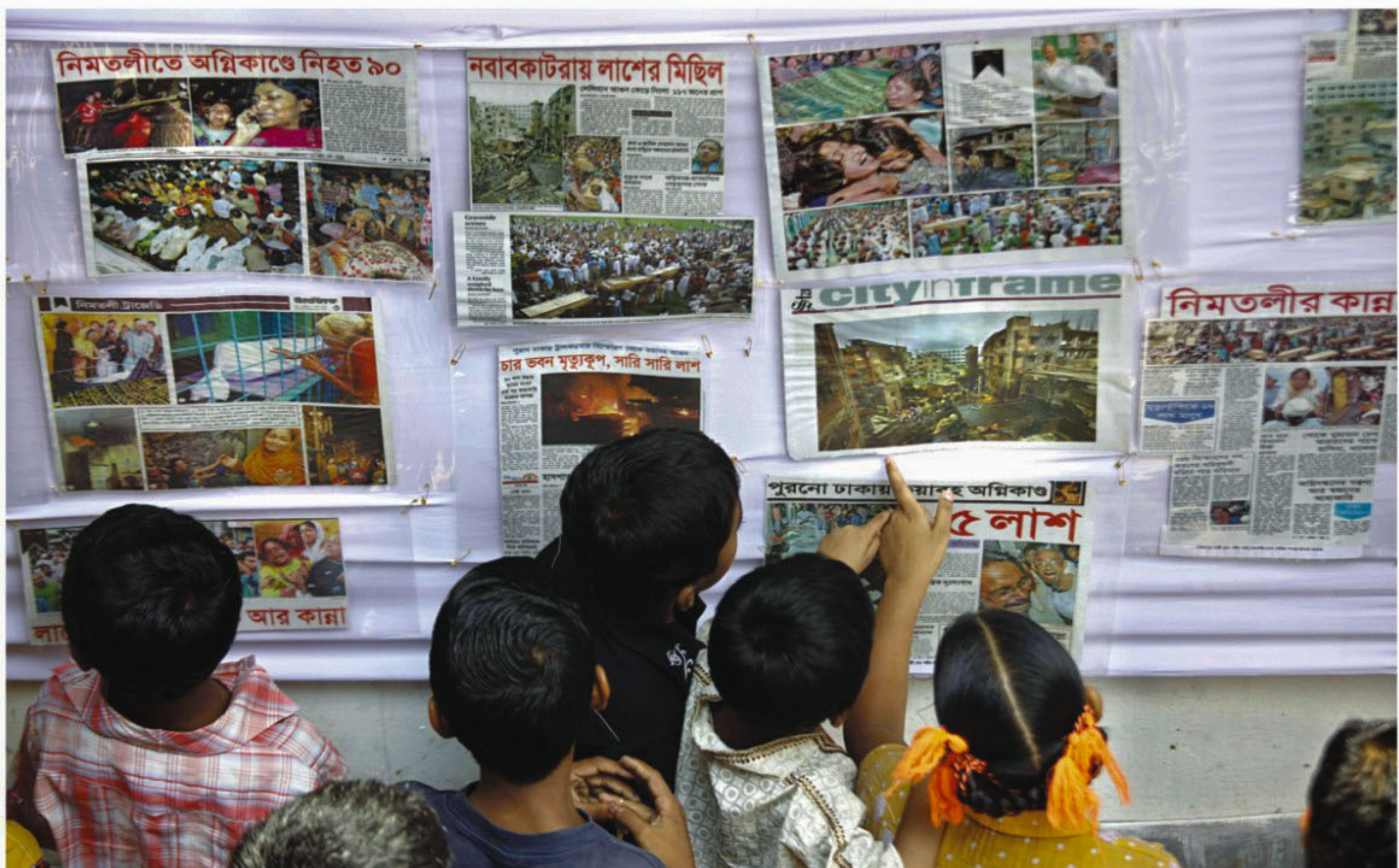
Children view newspaper clippings on the devastating Nimtoli fire in the city on June 3 last year claiming over a hundred lives. Locals of Nimtoli pasted the clippings in different parts of the area yesterday.

Power Cell will implement the Kutubdia RAPSS project, Cox's Bazar, Swandip RAPSS project, Chittagong and Hatia RAPSS project, Noakhali.