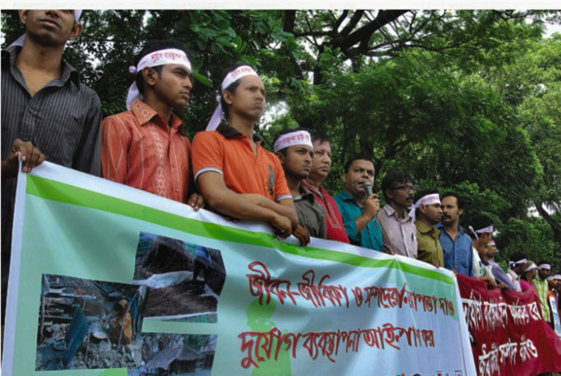
Nagorik Sanghati forms a human chain in front of Jatiya Press Club in the city yesterday demanding enactment of disaster management law.