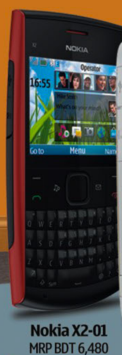
Nokia X2-01 MRP BDT 6,480