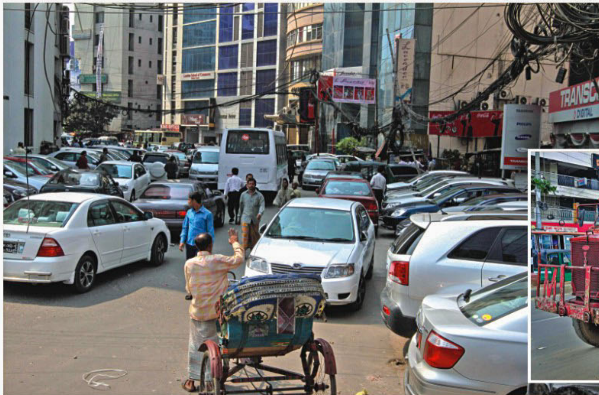
Lack of parking space leads to cars being parked at will on a Gulshan-2 street limiting space for vehicular movement. Authorities cannot tow them away since they have only four tow trucks and some are hardly usable, inset.