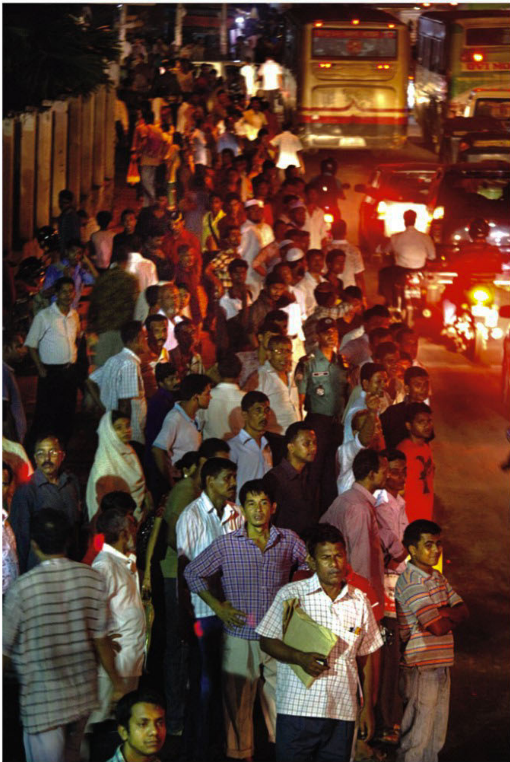
Even late in the night people wait for buses at Farmgate in the capital. The crack-down on bus operators for overcharging passengers resulted in a number of buses taken off the road with people being the ultimate sufferers.