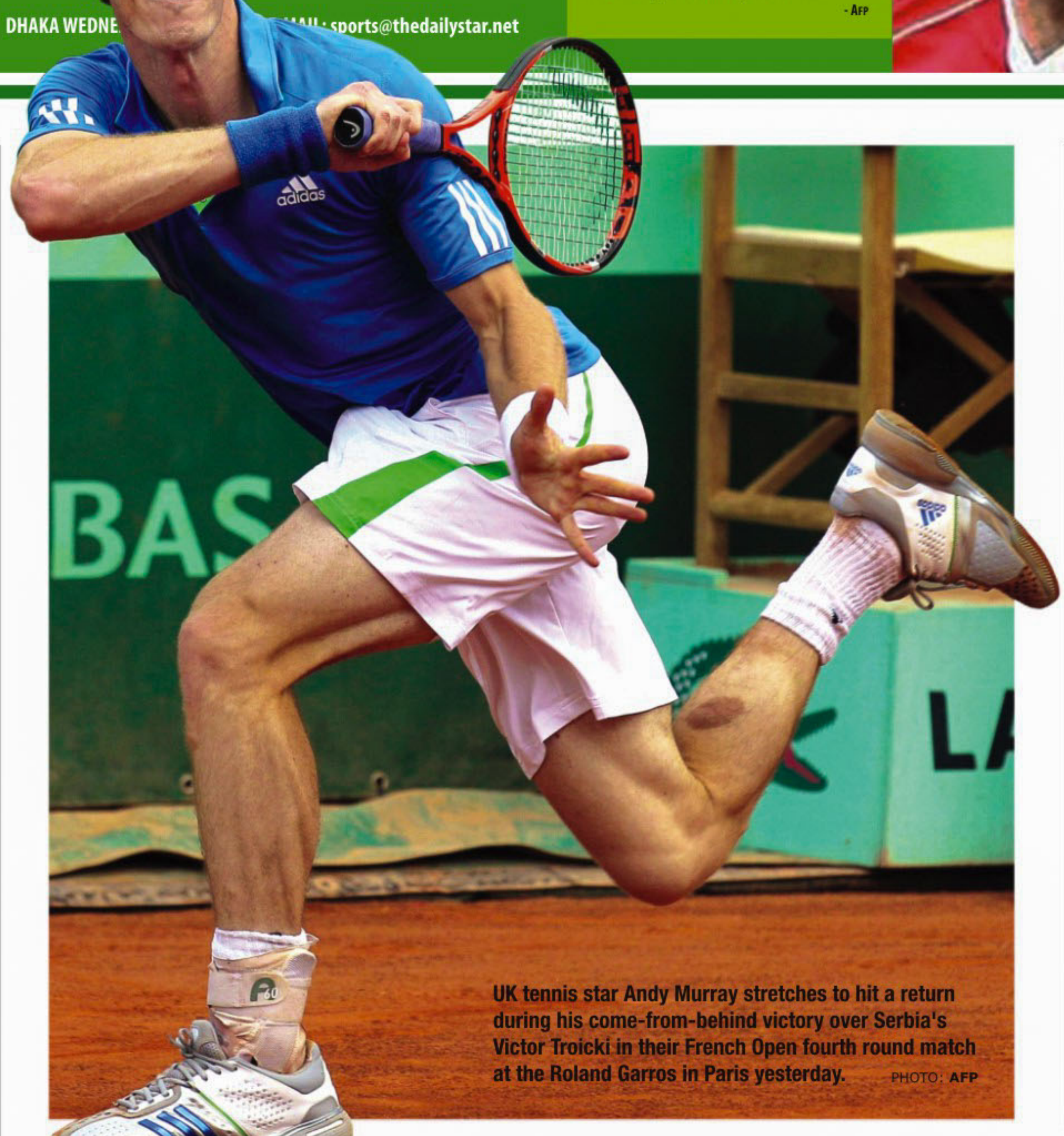
UK tennis star Andy Murray stretches to hit a return during his come-from-behind victory over Serbia's Victor Troicki in their French Open fourth round match at the Roland Garros in Paris yesterday.