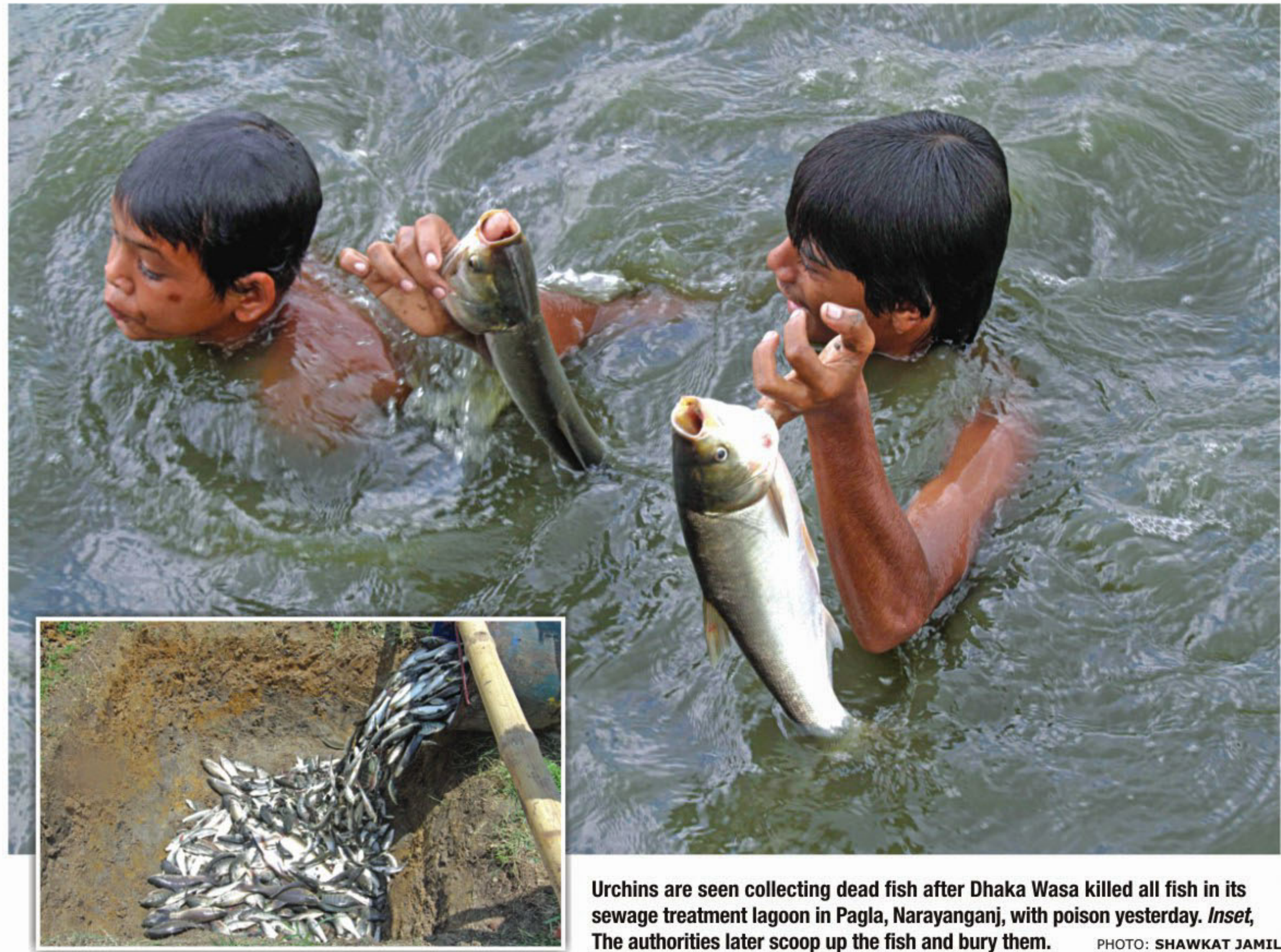
Urchins are seen collecting dead fish after Dhaka Wasa killed all fish in its sewage treatment lagoon in Pagla, Narayanganj, with poison yesterday. Inset, The authorities later scoop up the fish and bury them.

RAKIB HASNET SUMAN To ensure unity in the party's city unit ahead of the planned anti-government agitation, BNP has decided to back single candidate for the post of chairman in each of the 16 unions around the capital where elections to union parishads will be held next month. The main opposition party will not allow more than one contestant for the post of chairman to use party identity. In case of such elections, usually a number of leaders defy party orders and contest the polls, weakening the chances of victory of the party-backed candidate. All political parties consider control of the 16 unions vital as party leaders and activists usually collect people from these areas for successfully staging big political programmes like grand rallies and other political show-downs. BNP leaders think if the party-backed candidates can win these elections, it will bolster the city BNP as these unions are in the capital's Uttara, Demra, Shyampur, Badda and Khilgaon thanas, although these are not part of city corporation. SEE PAGE 19 COL 5