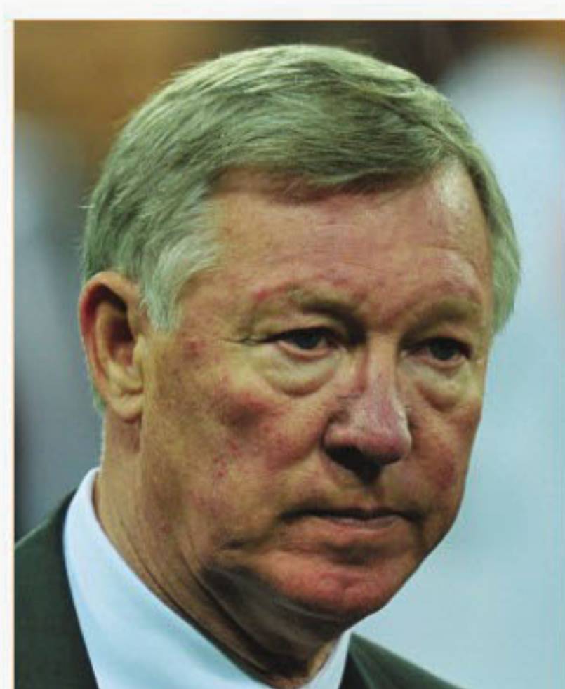
SIR ALEX FERGUSON

Wayne Rooney's 34th-minute equaliser wiped out Pedro's opener but the outstanding Messi restored Barca's lead early in the second half and David Villa killed off United. It must have been as painful for Ferguson and his players as the 2009 final in Rome when Barcelona ran out 2-0 winners against a United side which included Cristiano Ronaldo.