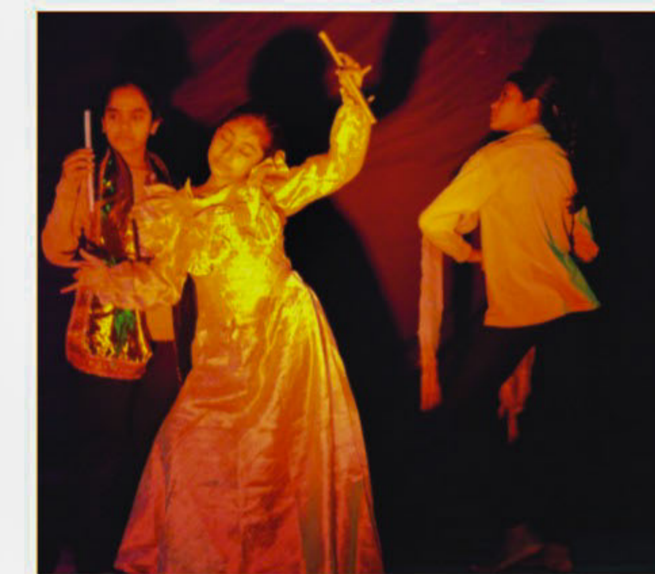
Barisal Shishu Theatre stages 'Kajjatra' at the festival.