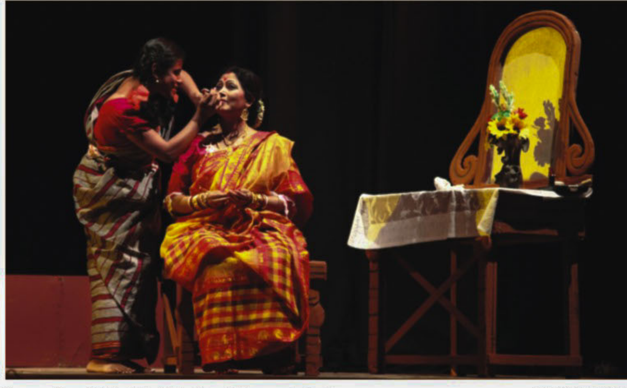
Scenes from "Strir Patra" (top) and "Jonmoshutro".