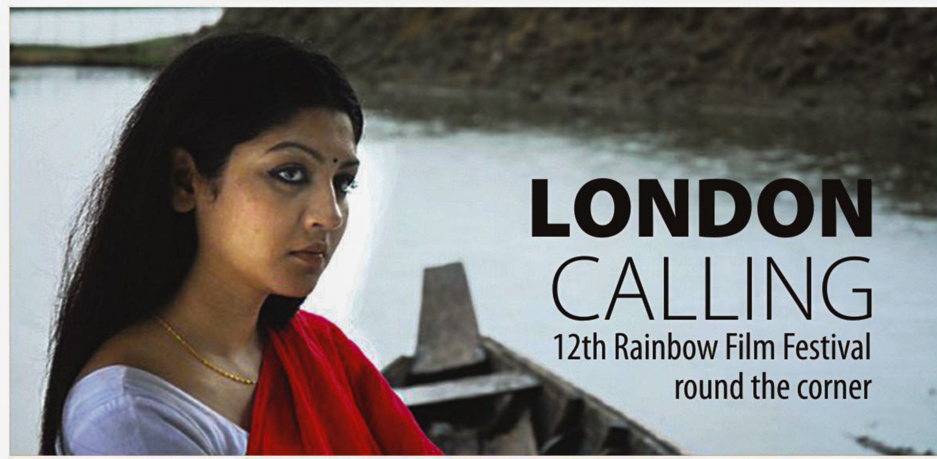
A scene from "Doob Shatar", one of the films to be screened at the festival.