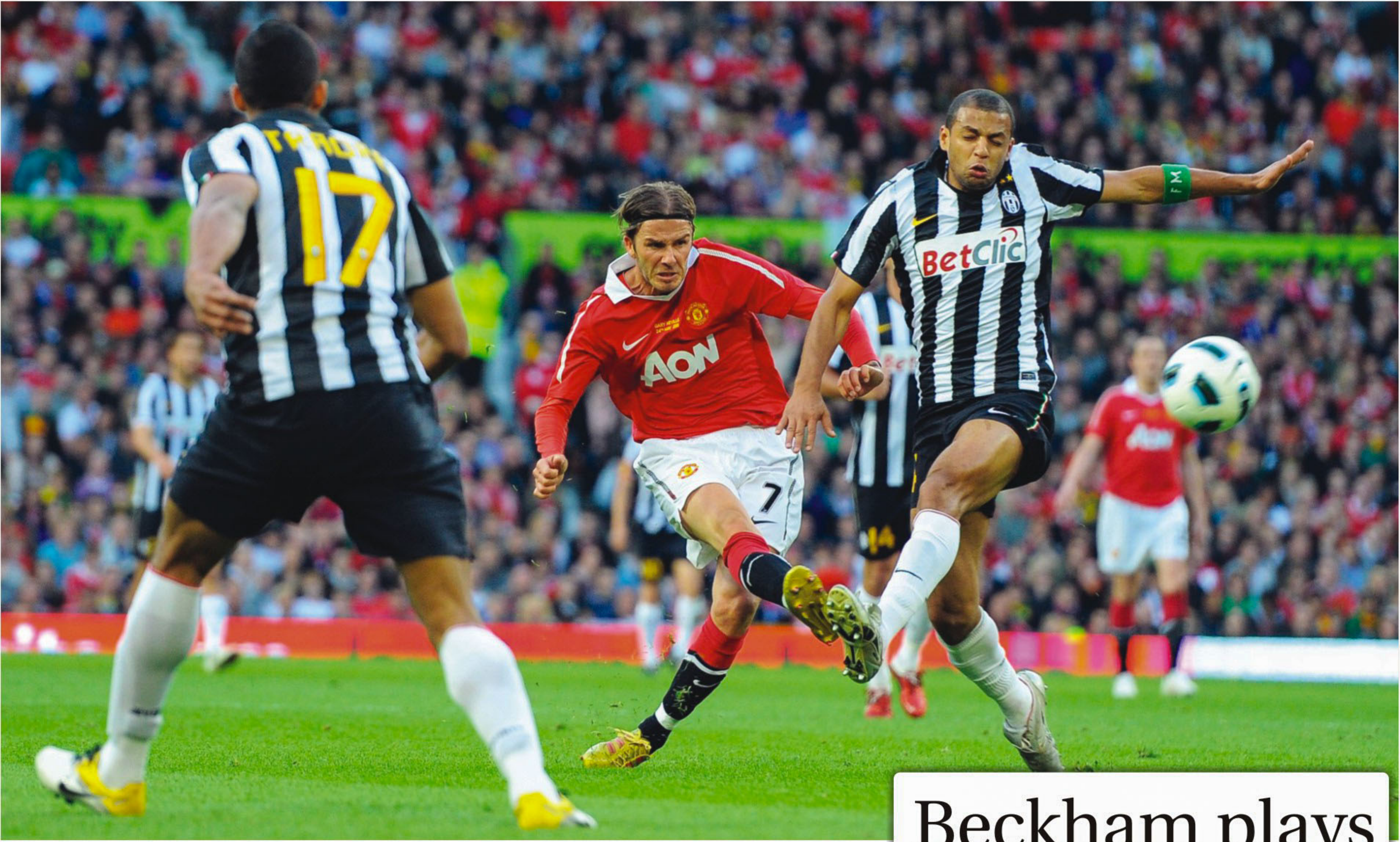
Former Manchester United star David Beckham (C) takes a shot under pressure from Juventus midfielder Felipe Melo (R) during Gary Neville's testimonial match at Old Trafford on Tuesday.