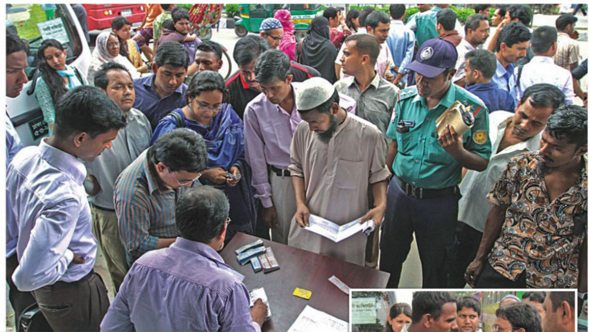
A mobile court assigned to check extra fares charging by bus operators receives complaints from passengers in front of Jatiya Press Club in the city yesterday. Passengers and supervisor of a bus are locked in a heated argument, inset, after its driver fled when intercepted by the court.