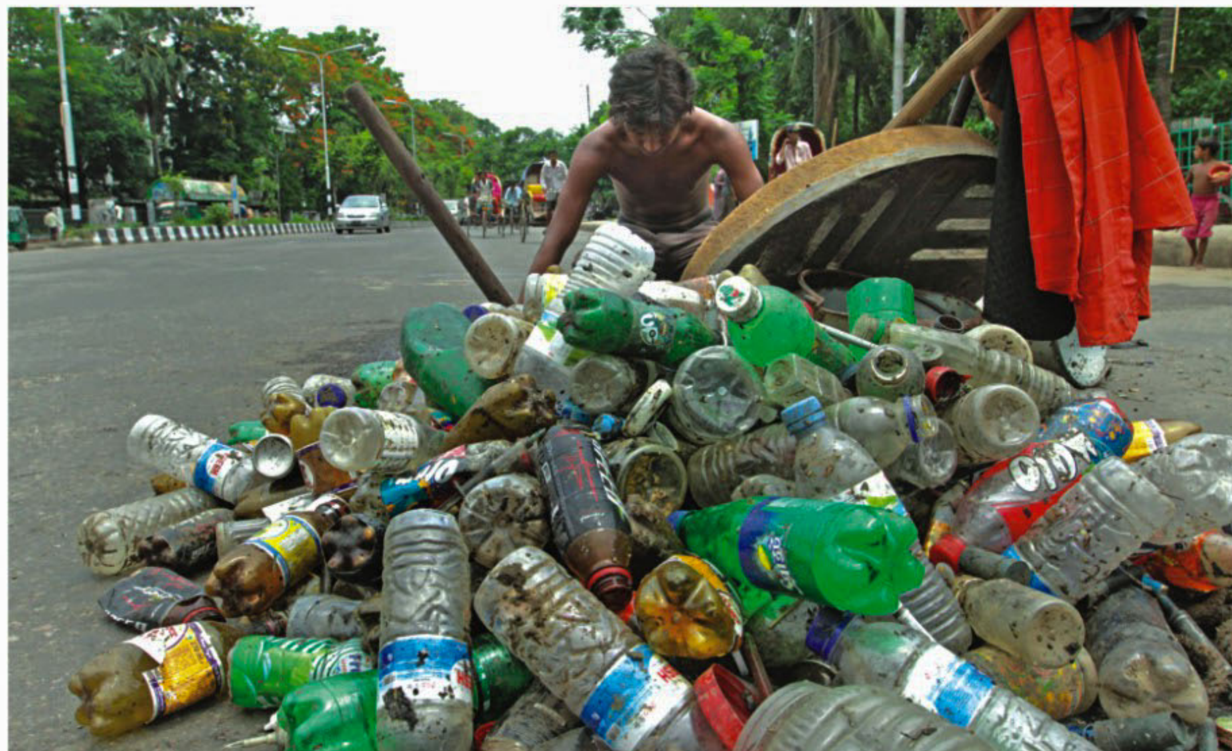
Plastic bottles collected from cleaning a manhole in Dhaka University area yesterday. The litter of used bottles often clog the city drains causing water logging, especially when it rains.