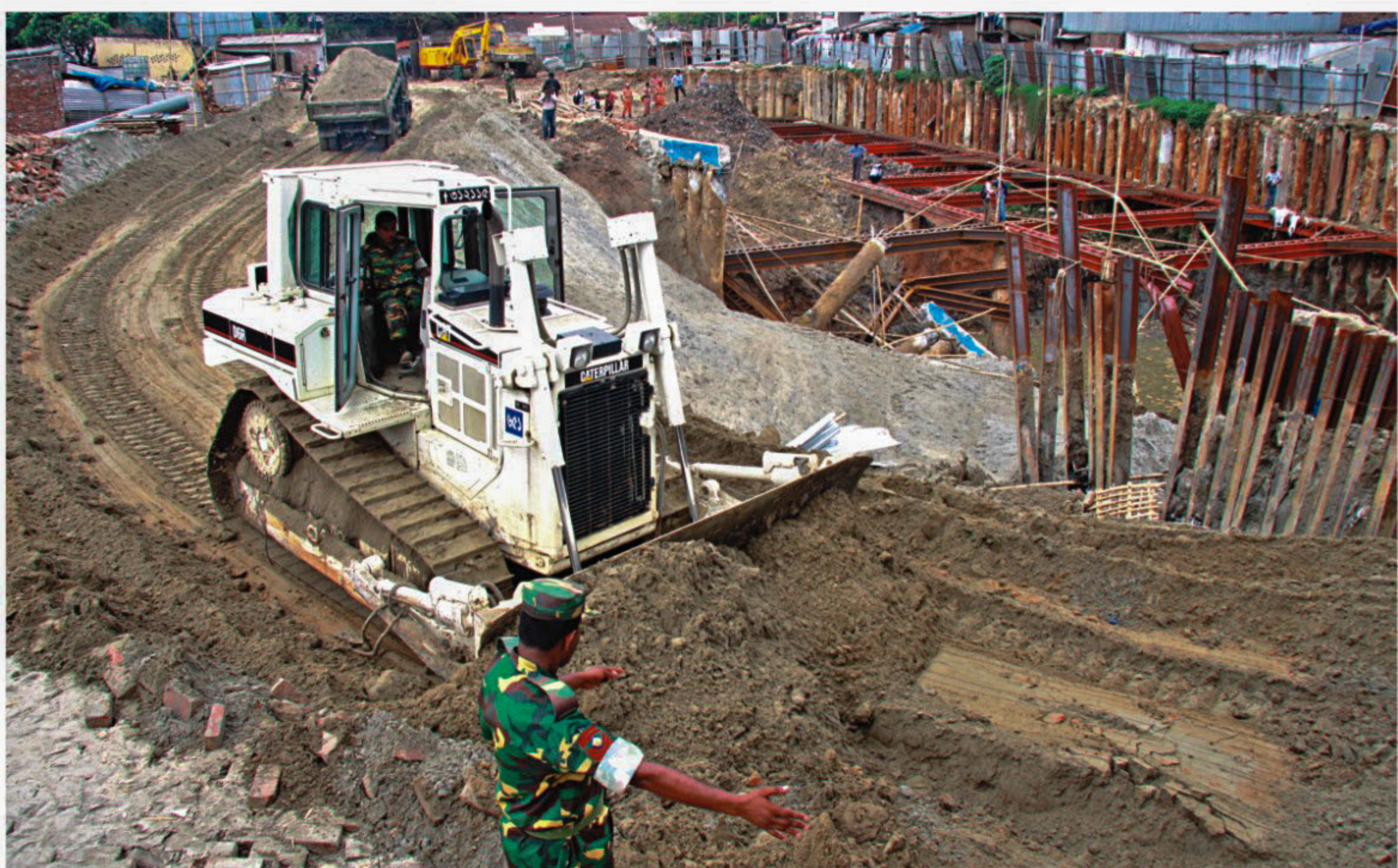
Army personnel filling up the gaping hole in the ground at Nakhhalpara in the capital where a large chunk of land subsided early Saturday putting several buildings at risk.