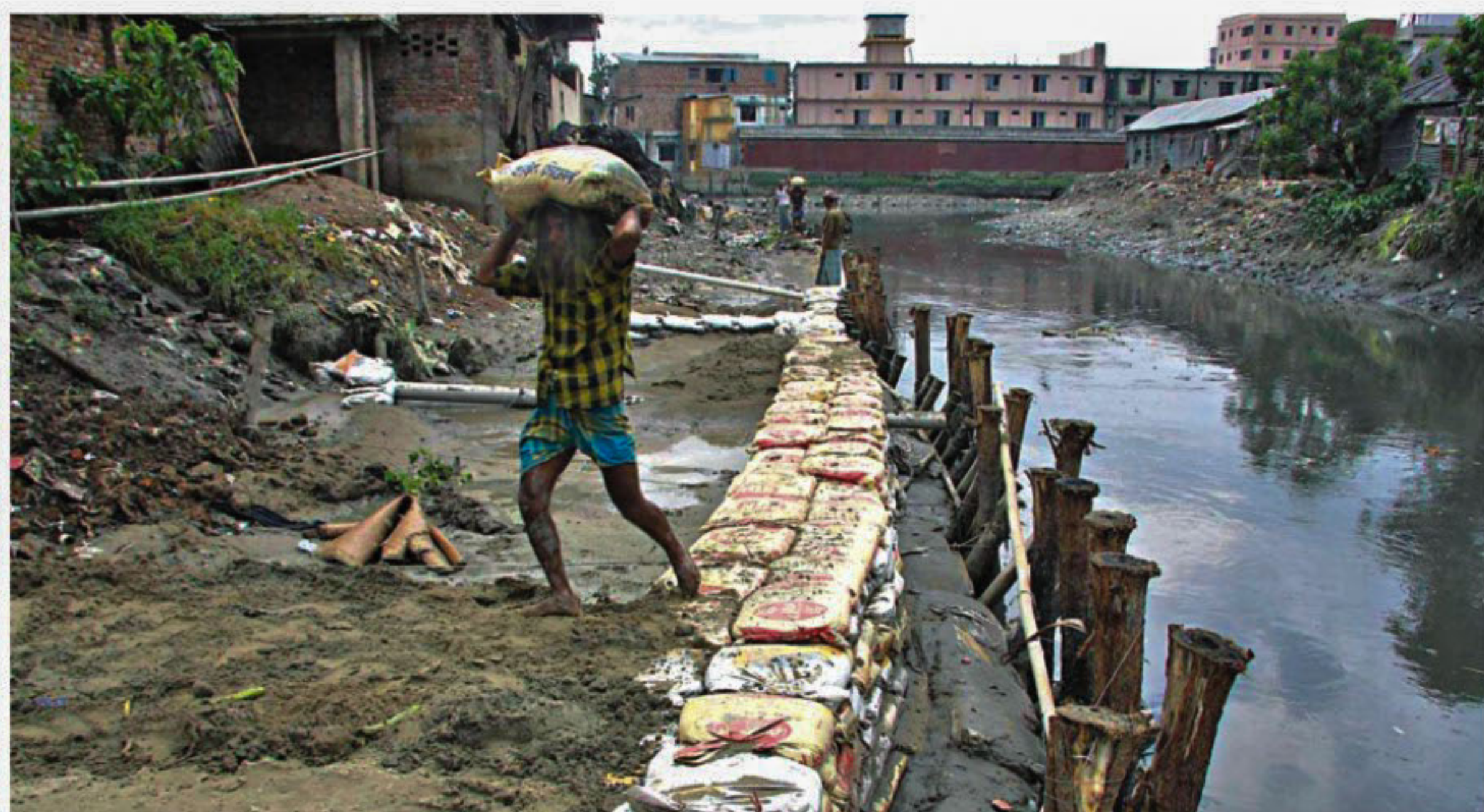
The buildings on the left have been constructed occupying land of Rajkhali canal in Chittagong. There has been no initiative to demolish the illegal structures. Moreover, Chittagong City Corporation is now constructing a pavement further encroaching upon the canal.

OUR CORRESPONDENT, Rangamati Police yesterday recovered the bodies of two more activists of United People's Democratic Front (UPDF), killed in Saturday's deadly attack in Rangamati. The bodies were among SEE PAGE 19 COL 4