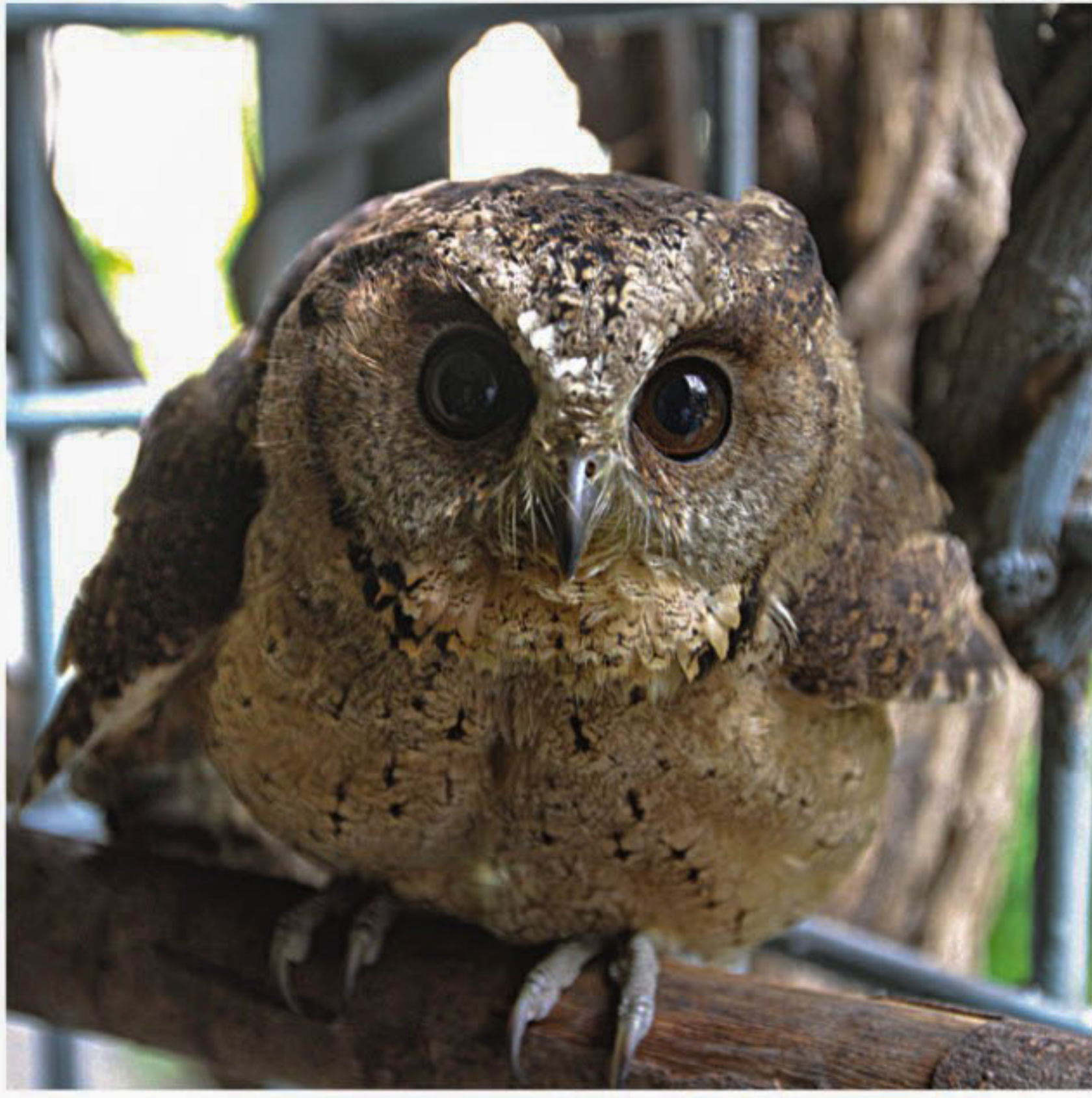
This collared scops owllet, which has an injured wing, was rescued from the Dhaka University campus last week. Known as Konthi Nim Pencha in Bangla, this nocturnal bird has become rarer in the capital as it nests in holes of old trees. Shrinking greenery, especially logging of old trees in the capital, has caused severe habitation loss to this species.