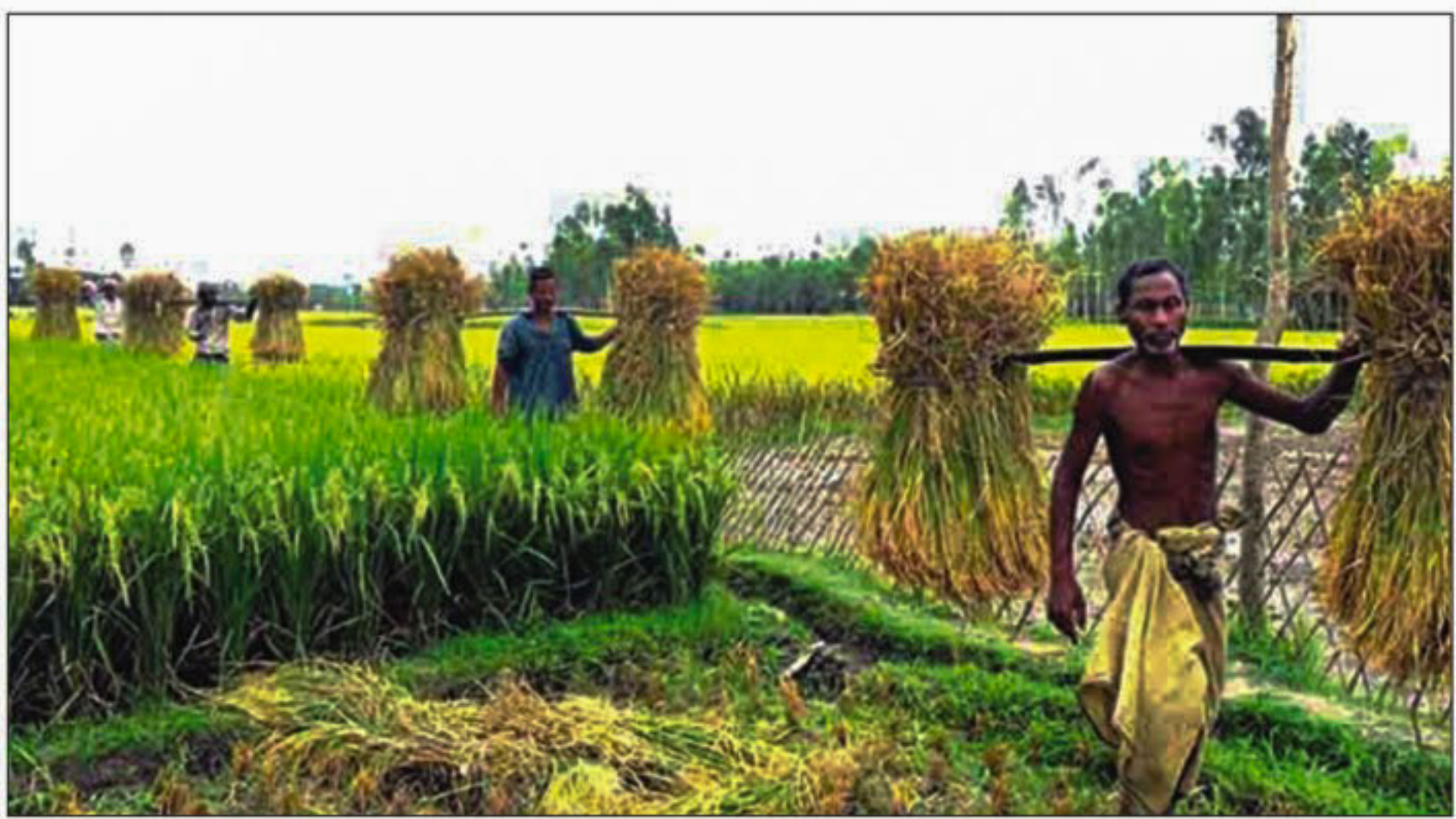
Farmers in Tulsighat of Gaibandha take their produce home following a bumper harvest of boro paddy.