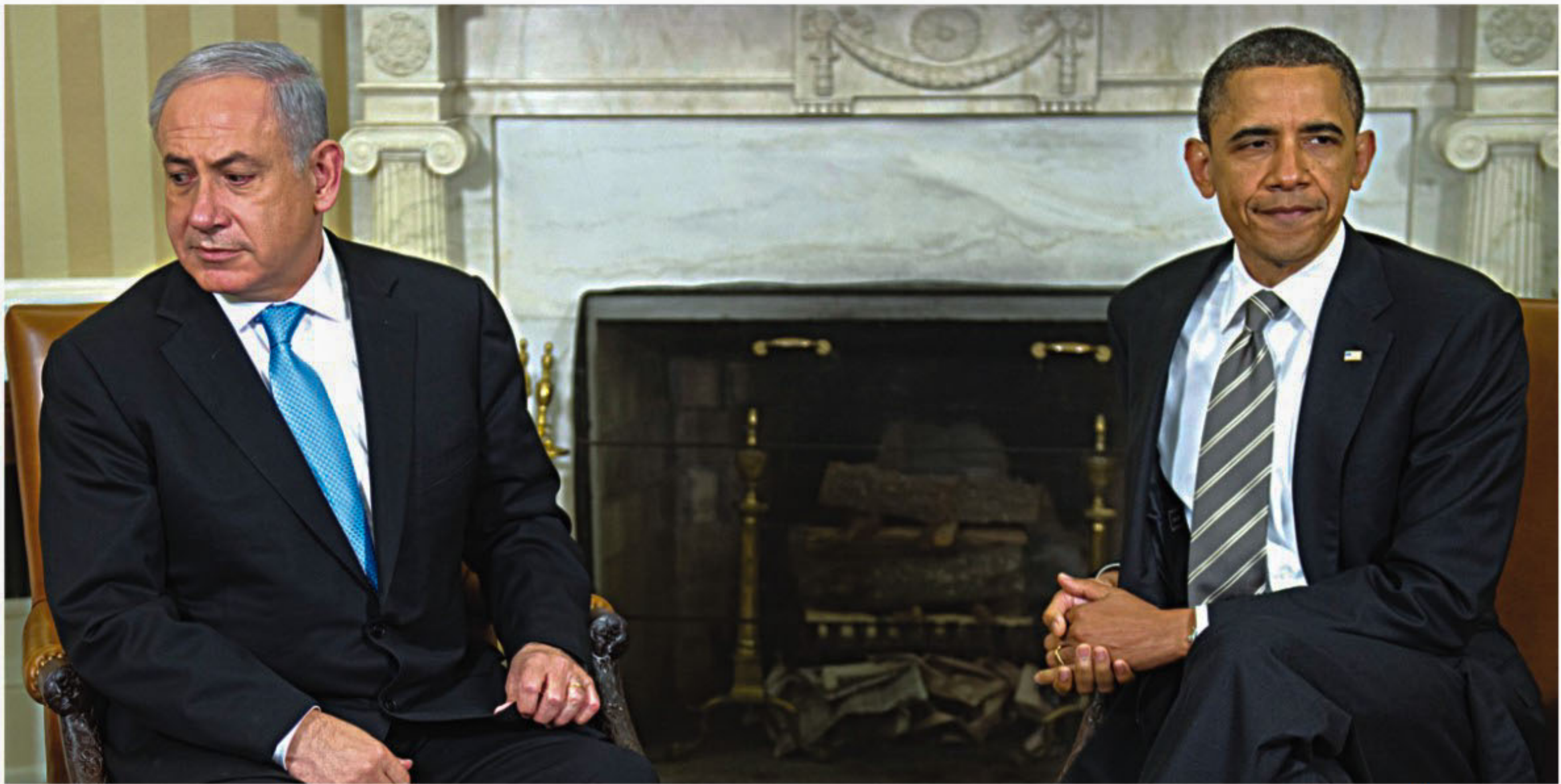
US President Barack Obama, right, meets Israeli Prime Minister Benjamin Netanyahu in the Oval Office of the White House in Washington DC Friday.

Israeli PM Benjamin Netanyahu has rejected US President Barack Obama's call for peace with the Palestinians based on pre-1967 borders. After tense talks at the White House on Friday, a defiant Netanyahu said Israel was prepared to compromise but there could be no peace "based on illusions". Obama, who formally adopted the principle on Thursday, admitted there were "differences" between the views. But he said such differences were possible "between friends". In his speech to the state department on Thursday, Obama stated overtly for the first time that the peace talks should be based on a future Palestinian state within the borders in place before the 1967 Middle East War. "The borders of Israel and Palestine should be based on the 1967 lines with mutually agreed swaps, so that secure and recognised borders are established for both states," he said.