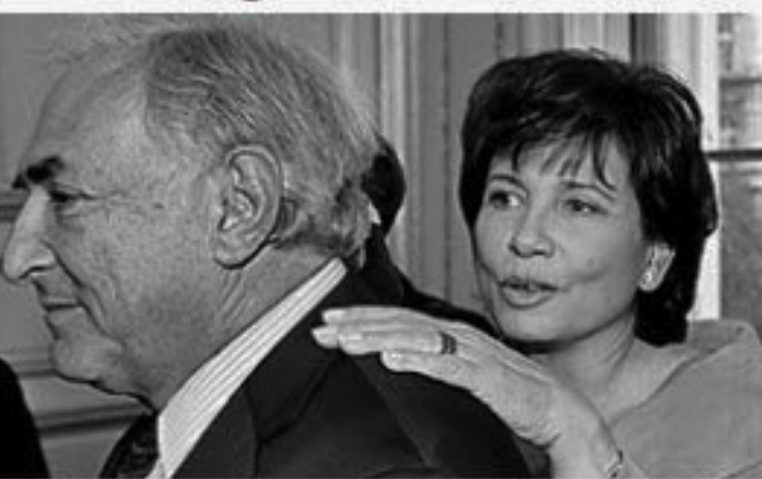
Strauss-Kahn with Anne Sinclair