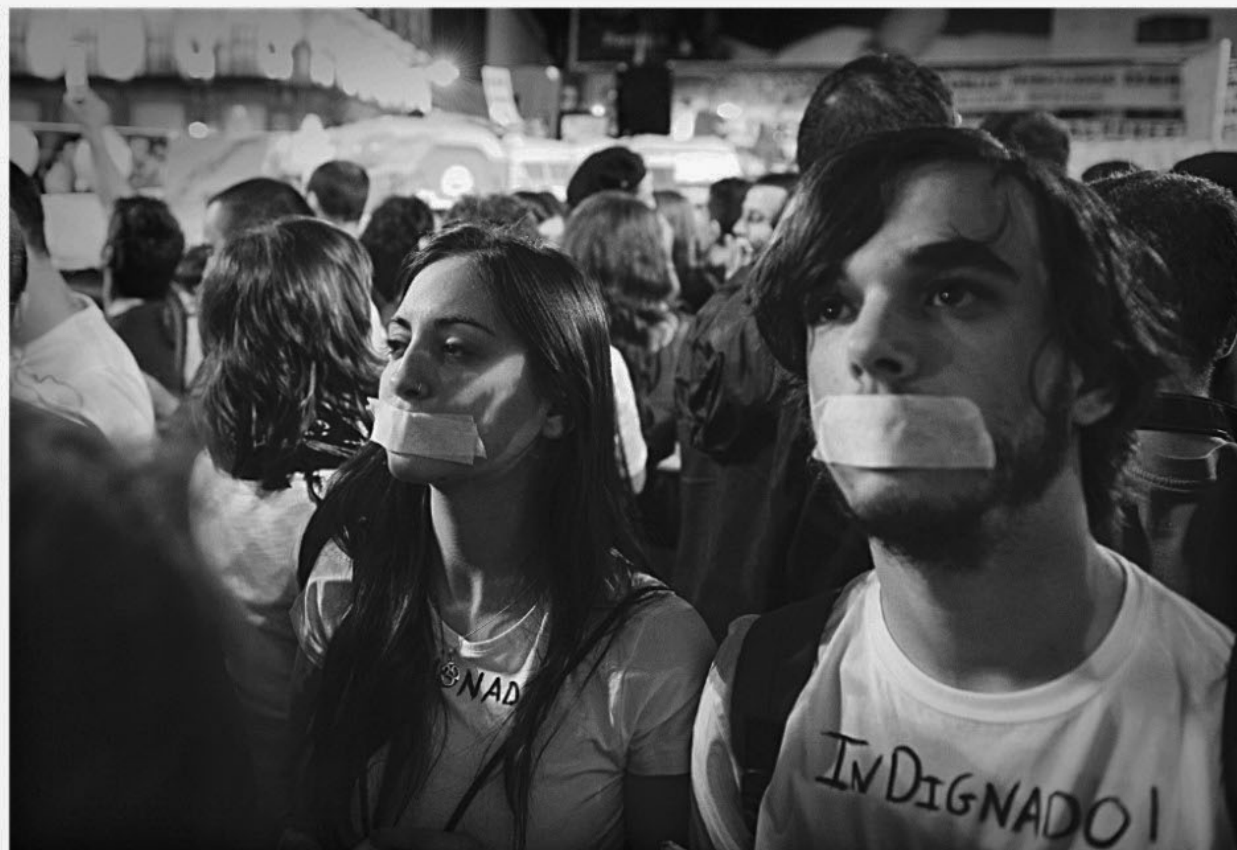
People with their mouths taped up participate in a protest against Spain's economic crisis and its sky-high jobless rate at the Puerta del Sol square in Madrid on Friday. Some 25,000 people, according to Spanish media, crammed the central Puerta del Sol square to stage a silent protest defying a ban on such gathering.

Alone in outright condemnation, Iran slammed Obama's statement as a sign of "despair".