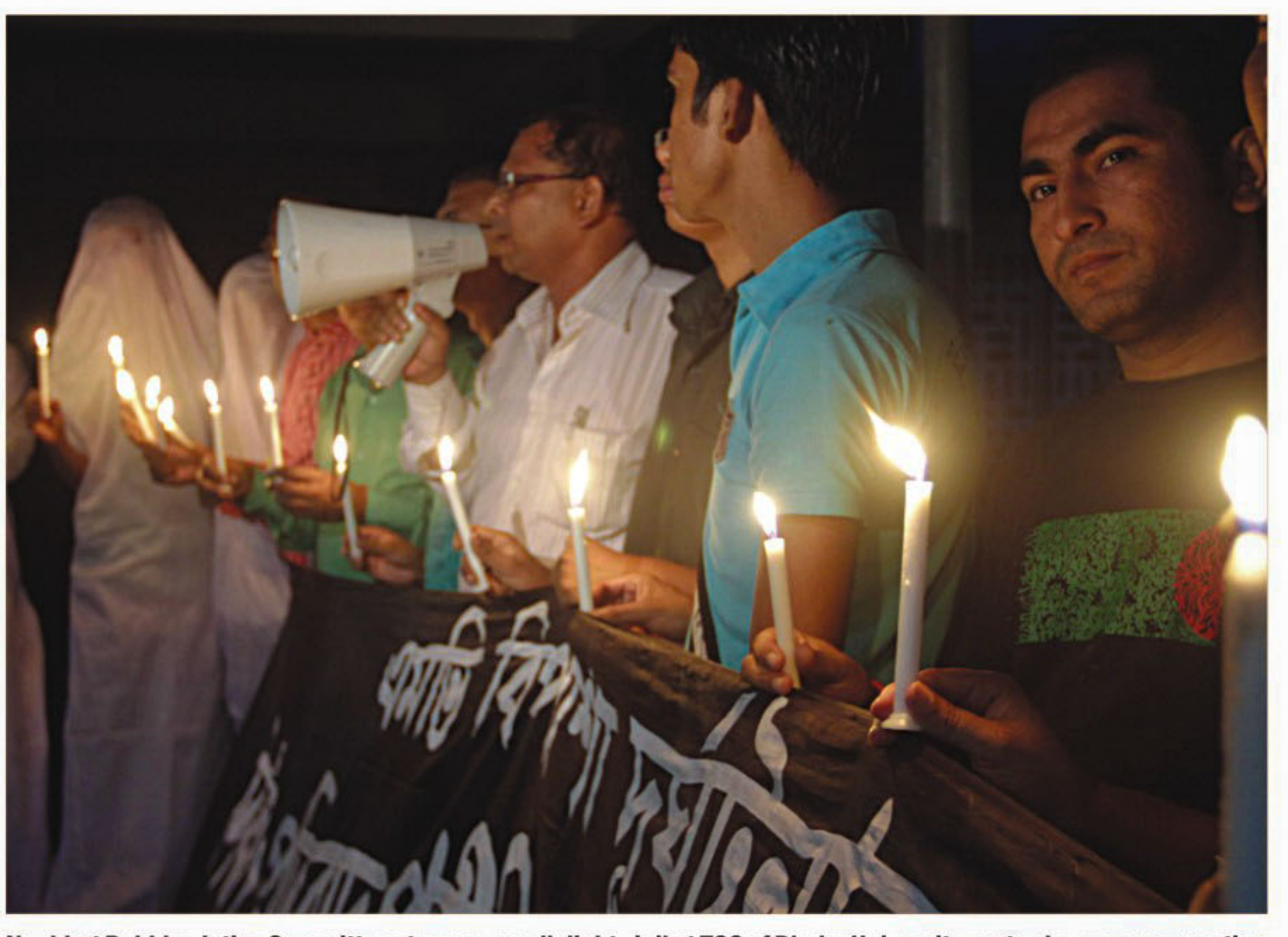
Noukhat Rakha Jatiya Committee stages a candlelight vigil at TSC of Dhaka University yesterday commemorating the victims killed after MV Bipasha sank into the river Meghna in Brahmanbaria 30 days ago.

Information and Cultural Affairs Minister Abul Kalam Azad yesterday called for establishing industries based on local raw material through public-private partnership for development of the country. He said this while visiting an industry, KBC Agri Products Private Limited, a joint venture of Bangladesh and India at Dhamrai here. Azad called upon the rich section of the society to come forward to establish industries and using local raw materials. Earlier, the minister attended a prize giving ceremony and reception accorded to the students who scored GPA 5.00 in the SSC examination this year.