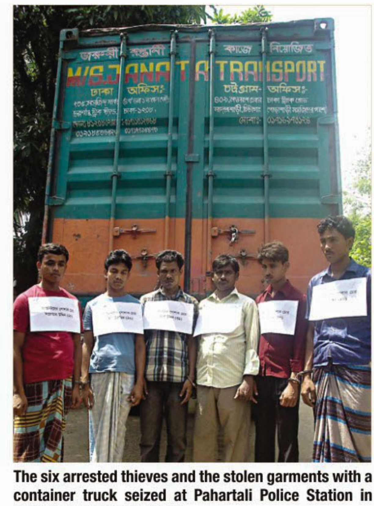
The six arrested thieves and the stolen garments with a container truck seized at Pahartali Police Station in Chittagong city yesterday.