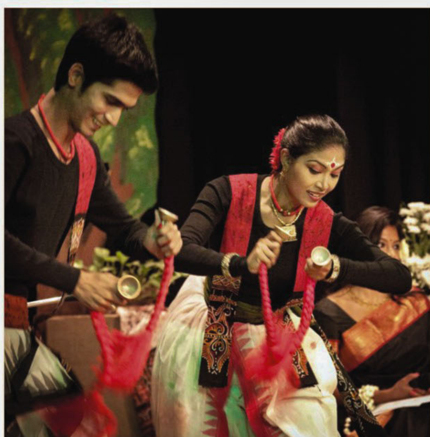
Although the event was divided in six segments, the sequence of music, dance, and narration was completely seamless and uninterrupted.