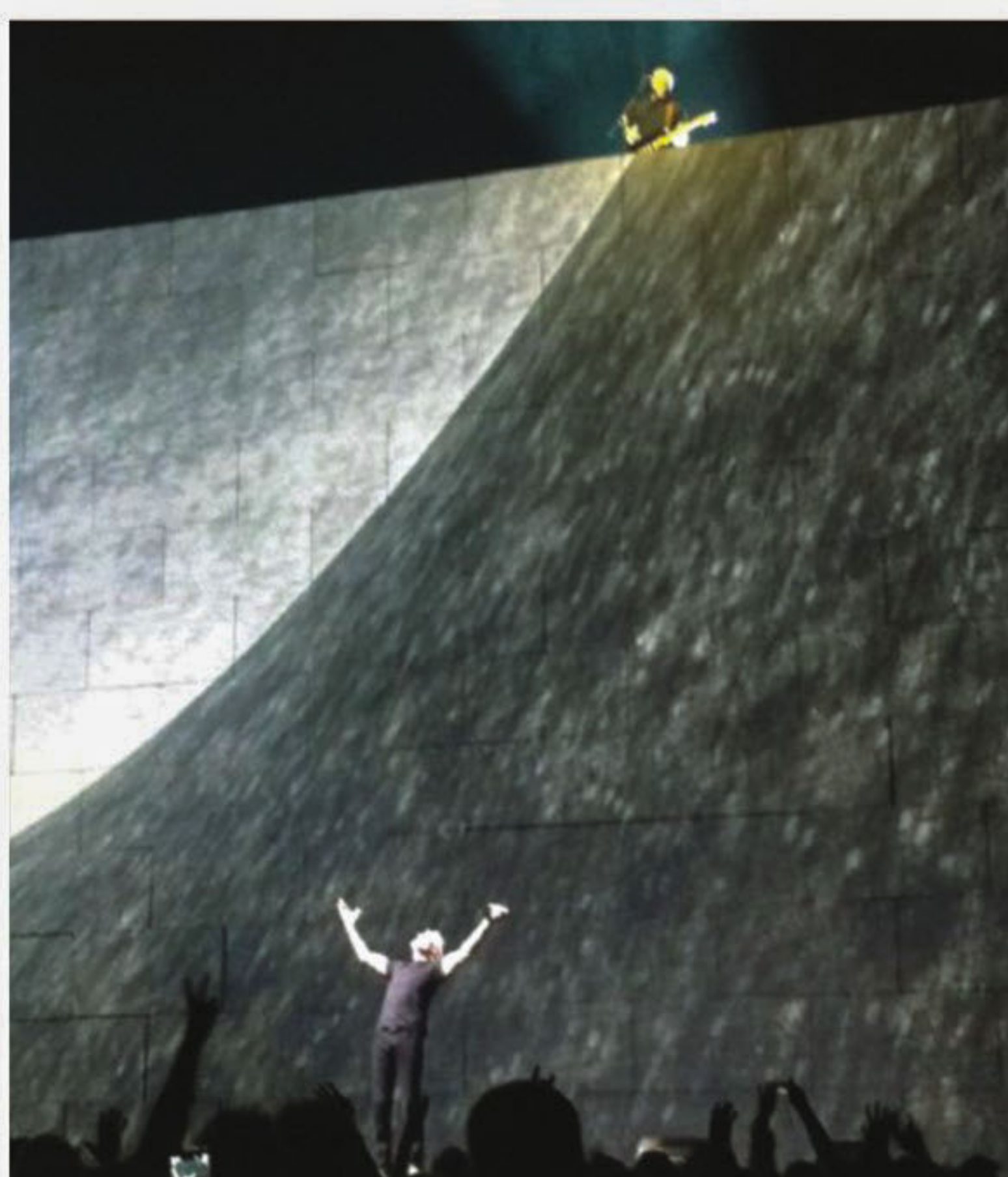
The defining moment of the concert was Gilmour's appearance on top of the wall.