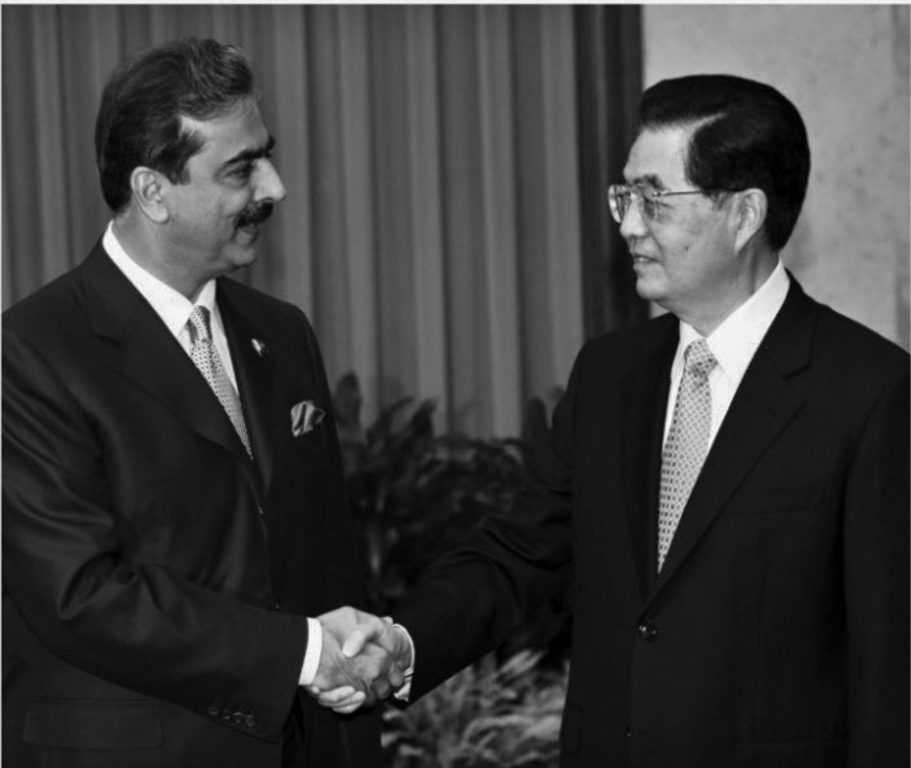
Pakistan's Prime Minister Yusuf Raza Gilani (L) shakes hands with China's President Hu Jintao during a meeting at the Great Hall of the People in Beijing, yesterday.

"The destruction last night of the facility and a significant stockpile of the boats will reduce the regime's ability to sustain such tactics," he added.