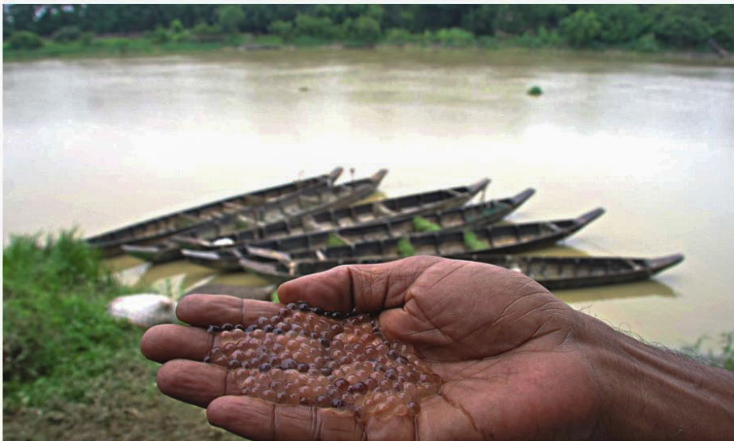
Spawns collected from the river Halda in Chittagong yesterday. As it began raining early Wednesday, a number of local fish species started releasing eggs at different points of the river.