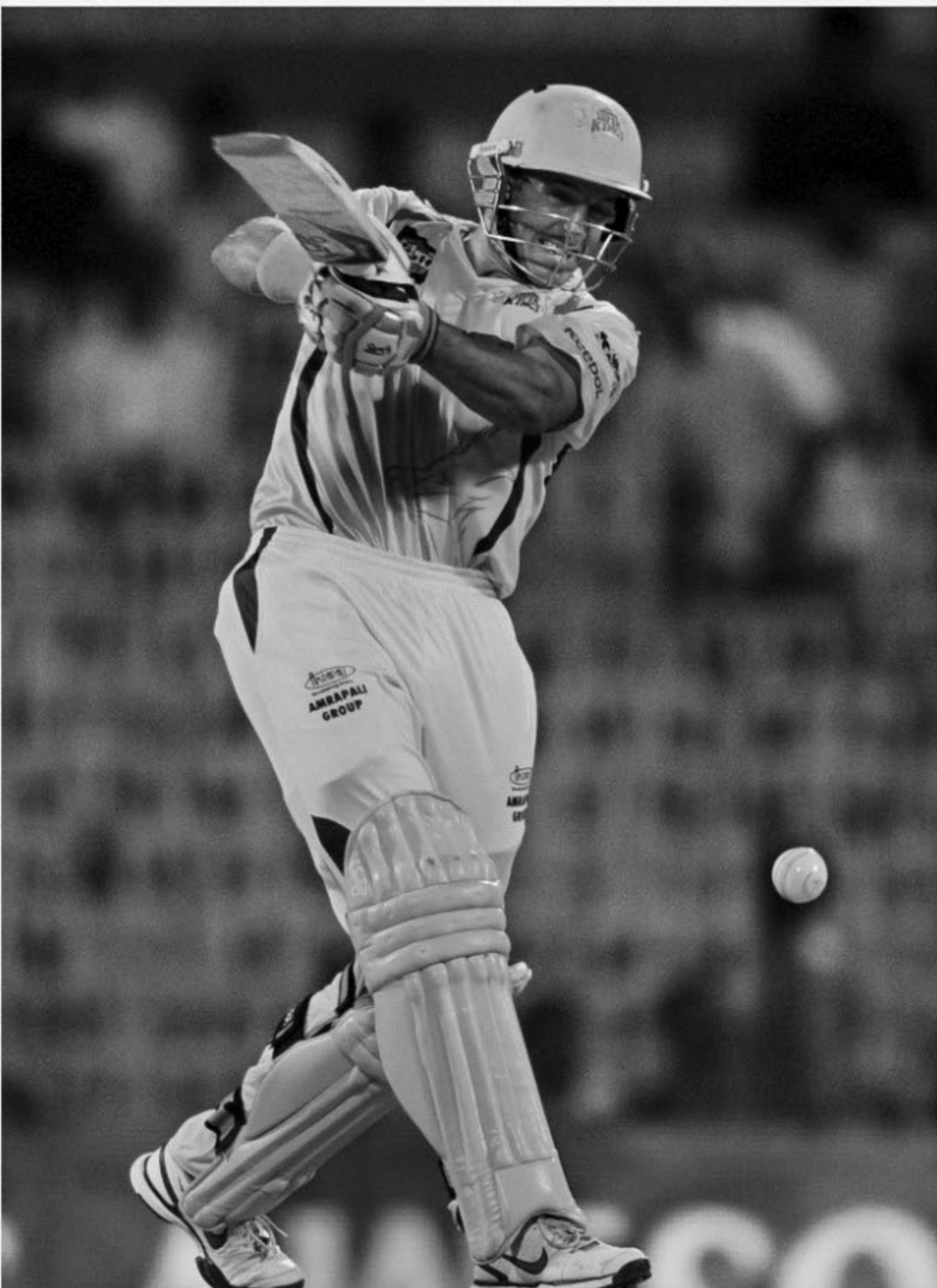
Chennai Super Kings batsman Michael Hussey plays the pull during their IPL match against Kochi Tuskers Kerala at the MA Chidambaram Stadium in Chennai yesterday.