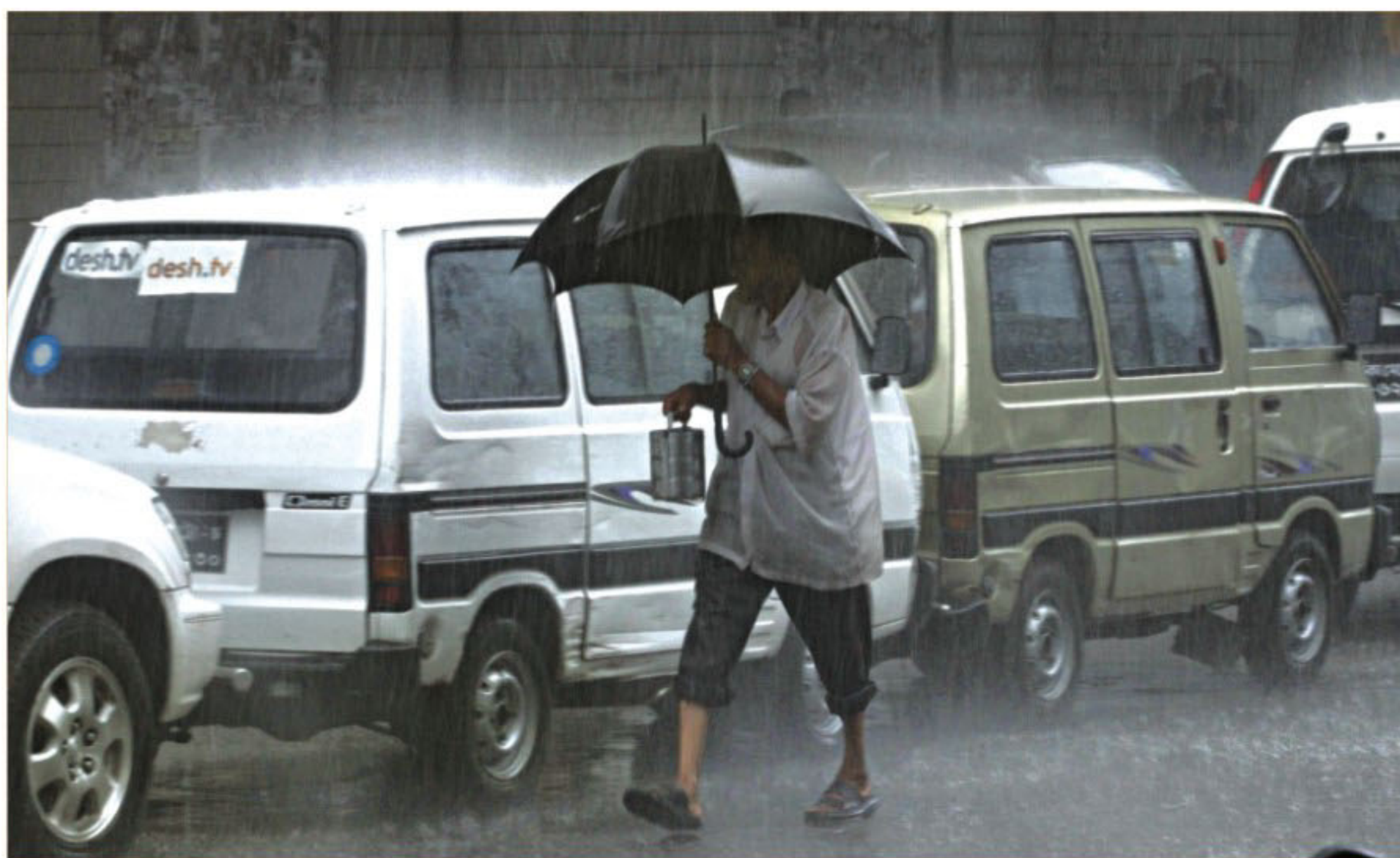
A few minutes of heavy rainfall relieves city dwellers around 1:00pm yesterday after the hot spell prevailing over the last couple of days. The photo was taken from Motijheel in the city.

The programme includes placing of wreaths at the portrait of Bangabandhu at Bangabandhu Memorial Museum in the city, doo seeking good health and long life of Hasina, meeting with injured freedom fighters and distribution of foods at orphanages.