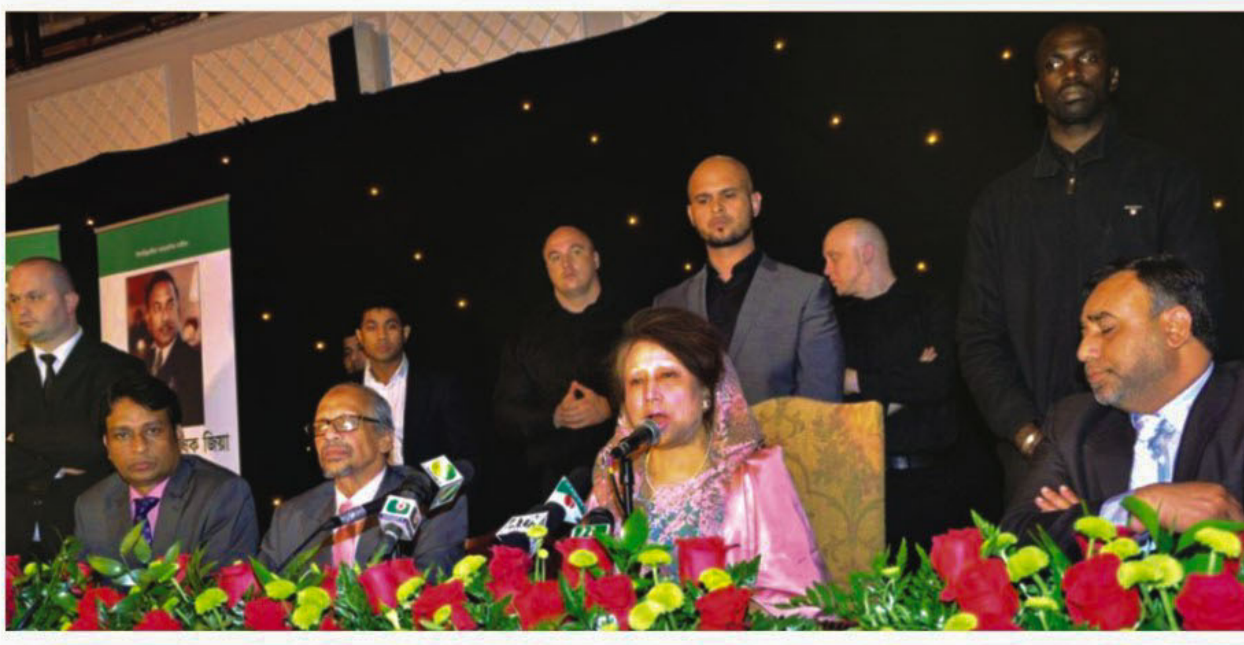
BNP Chairperson Khaleda Zia speaks at a BNP workers convention in London yesterday. (Story on Page 1)