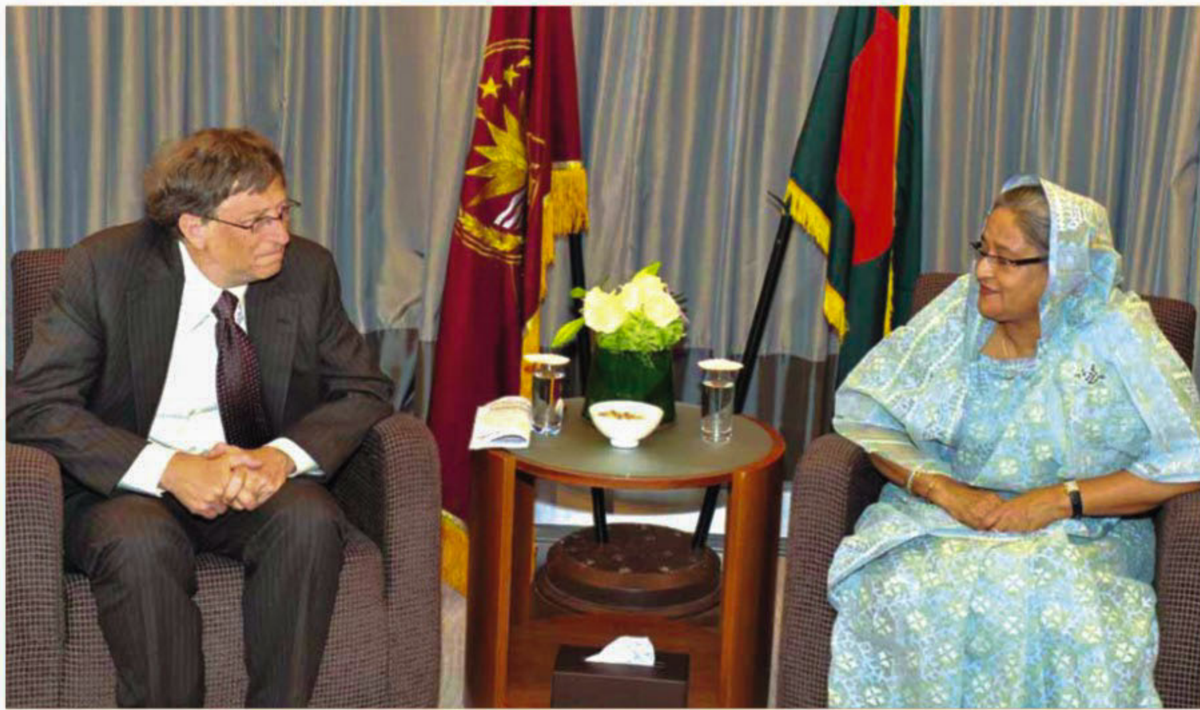
Microsoft Chairman Bill Gates meets Prime Minister Sheikh Hasina at Geneva in Switzerland yesterday.