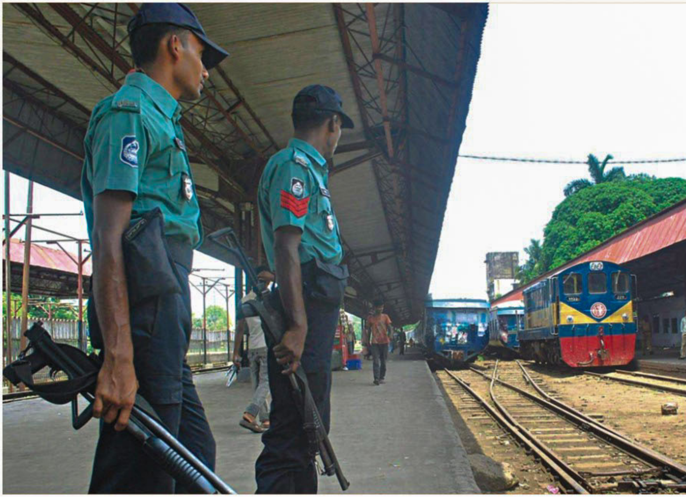
Police posted at Bottoli Station after Chittagong University unit of Bangladesh Chhatra League (BCL) blocked movement of the university-bound shuttle trains. (Right) One of the shuttle trains vandalised by BCL men.