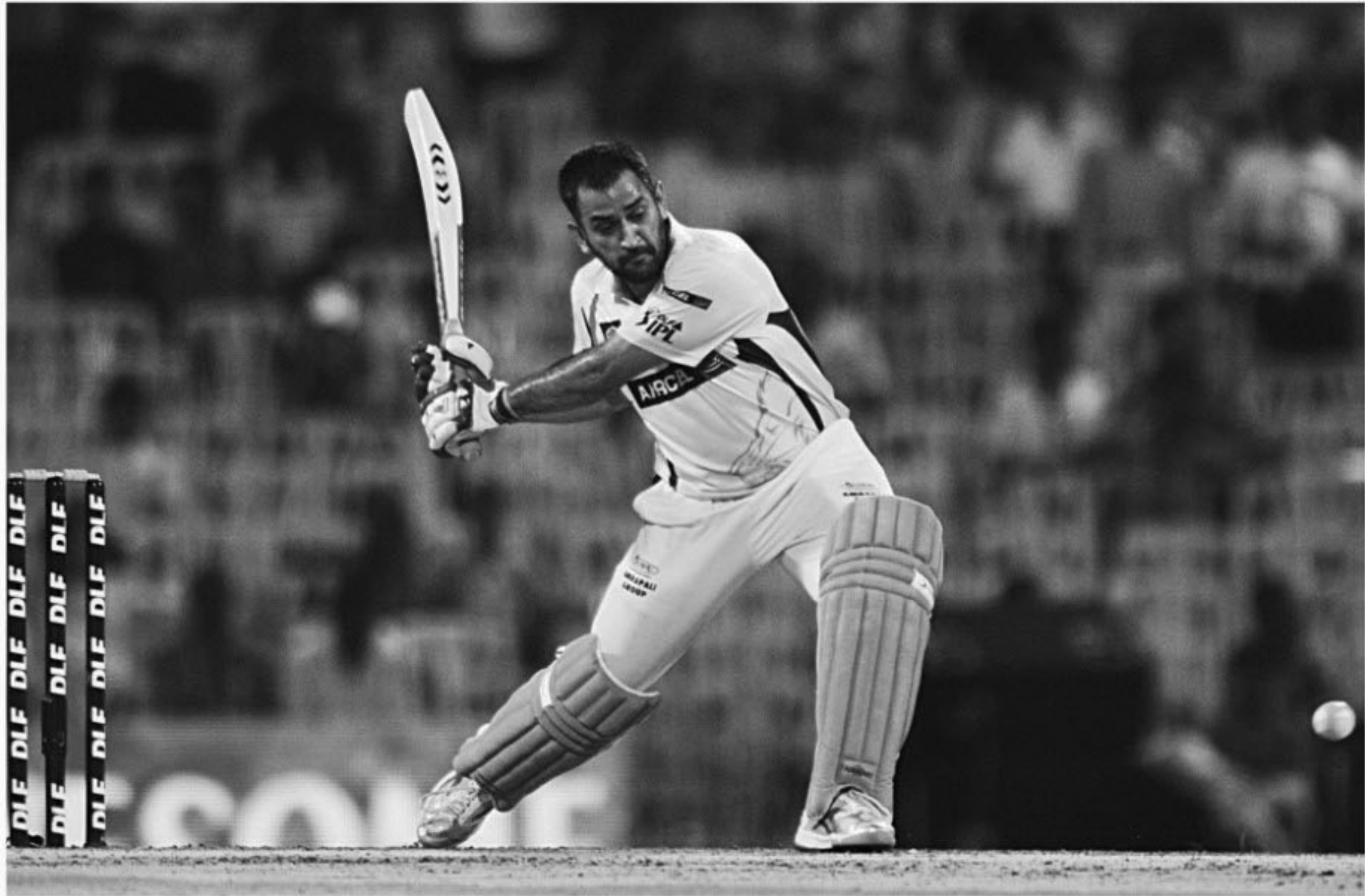
Chennai Super Kings captain Mahendra Singh Dhoni sets up for a whack during his knock of 63 not out against Delhi Daredevils at the MA Chidambaram Stadium in Chennai yesterday.

But Dave Richardson, the ICC's general manager for cricket, was confident of changing Indian views.