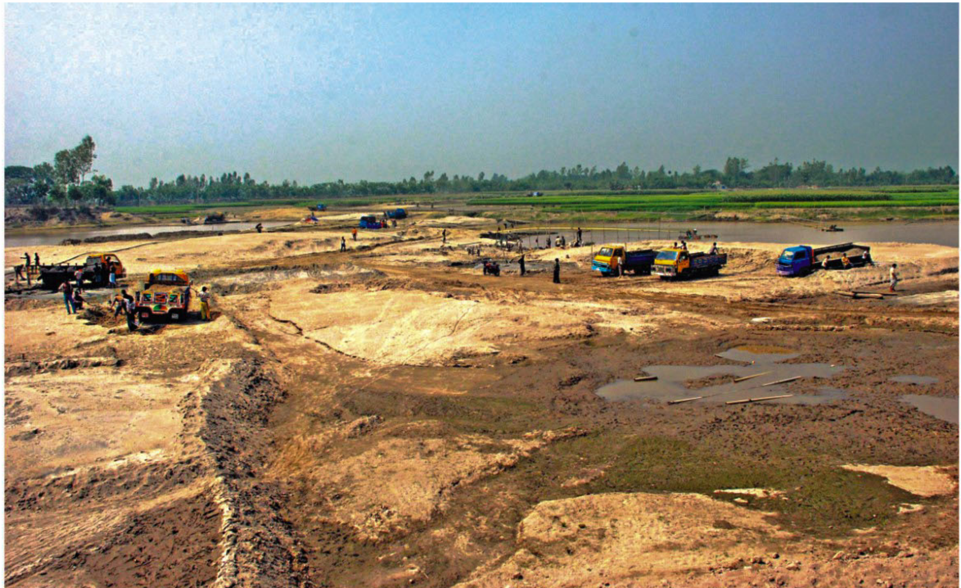
Sand traders excavate around a kilometre of arable land at Manik Chawk in Bogra. The local authorities concerned seem rather reluctant in moving against such destruction of arable land while clashes between traders and farmers have become common.

Bangladesh is set to release in two years a rice variety enriched with zinc which might effectively fight zinc deficiency that causes physical and mental problems. Most people in the country suffer from zinc deficiency. Growth of children is hampered and their disease prevention capacity decreases due to such deficiency. Forty-three percent children under five are stunted, 43 percent suffer from underweight and 64 percent suffer from anaemia, experts say. Scientists conducting a long-running breeding experiment on iron and zinc content in rice have found 12 to 36 milligrams of zinc in rice per kilogram whereas polished rice in Bangladesh generally contains 3 to 4 mg of zinc per kilogram on an average. "Concentrations of 24 milligrams of zinc a kilogram have been identified in several advanced breeding lines, which are the fast-track breeding lines for developing high-zinc rice variety in Bangladesh," said Dr Alamgir Hossain, principal scientific officer at Bangladesh Rice Research Institute (BRRI). BRRI in cooperation with HarvestPlus, an international crop research organisation, has been conducting the breeding experiment on enhancement of iron and zinc content in rice in Bangladesh since 2005-06. The progress made in the experiment was revealed SEE PAGE 19 COL 8