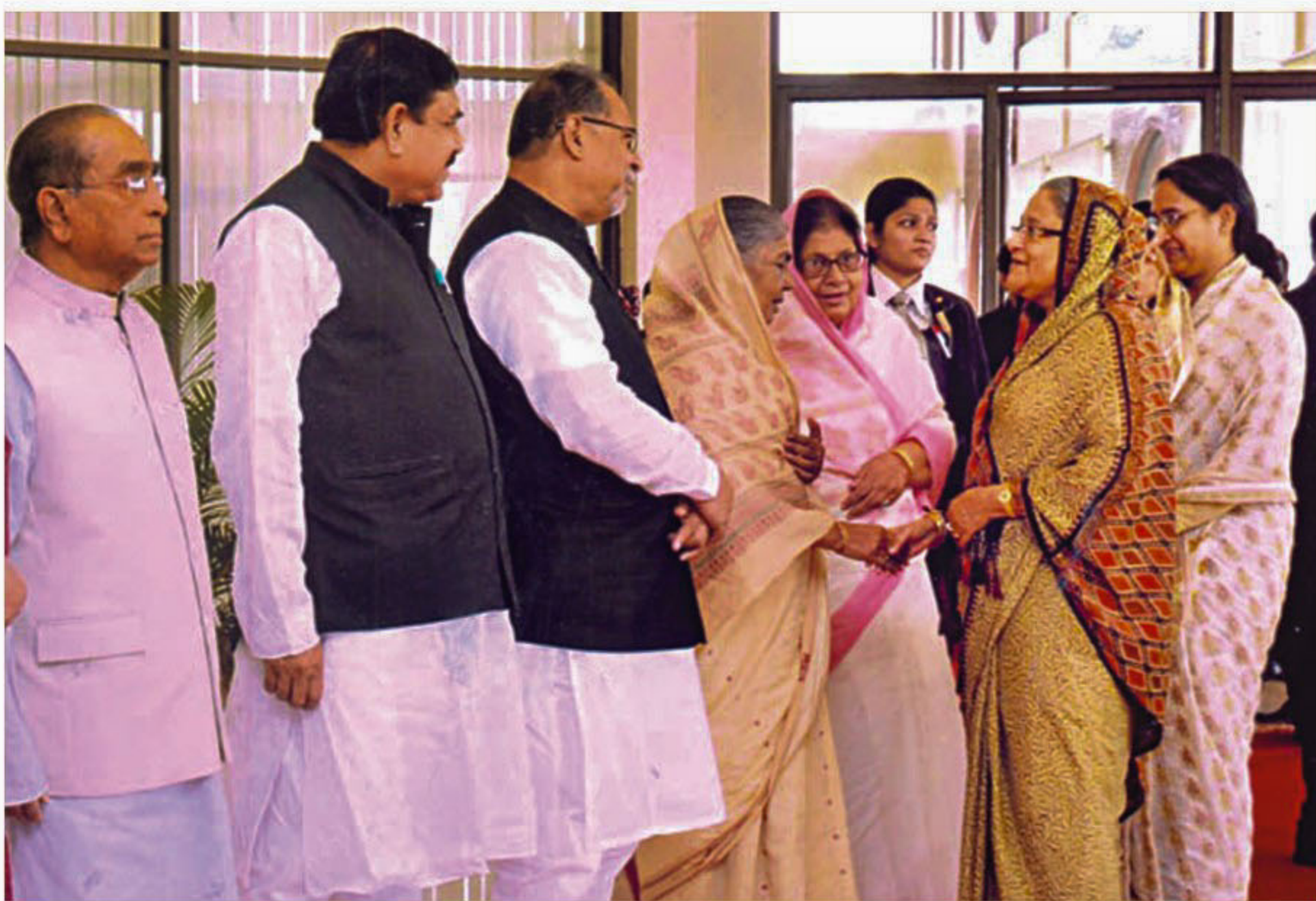
Prime Minister Sheikh Hasina being received at Hazrat Shahjalal International Airport by cabinet members, senior AL leaders, chiefs of three services, and foreign diplomats in Dhaka yesterday on her return upon completion of a four-day official visit to Turkey to attend the fourth UN Conference on LDCs.

The IDEA project would aid the government's effort to establish a reliable and authoritative national identification system that can serve as an efficient, secure data platform. The project would focus on developing a legal and policy framework for the national ID system, upgrading data quality, and supporting the strengthening of Election Commission to administer the national ID system.