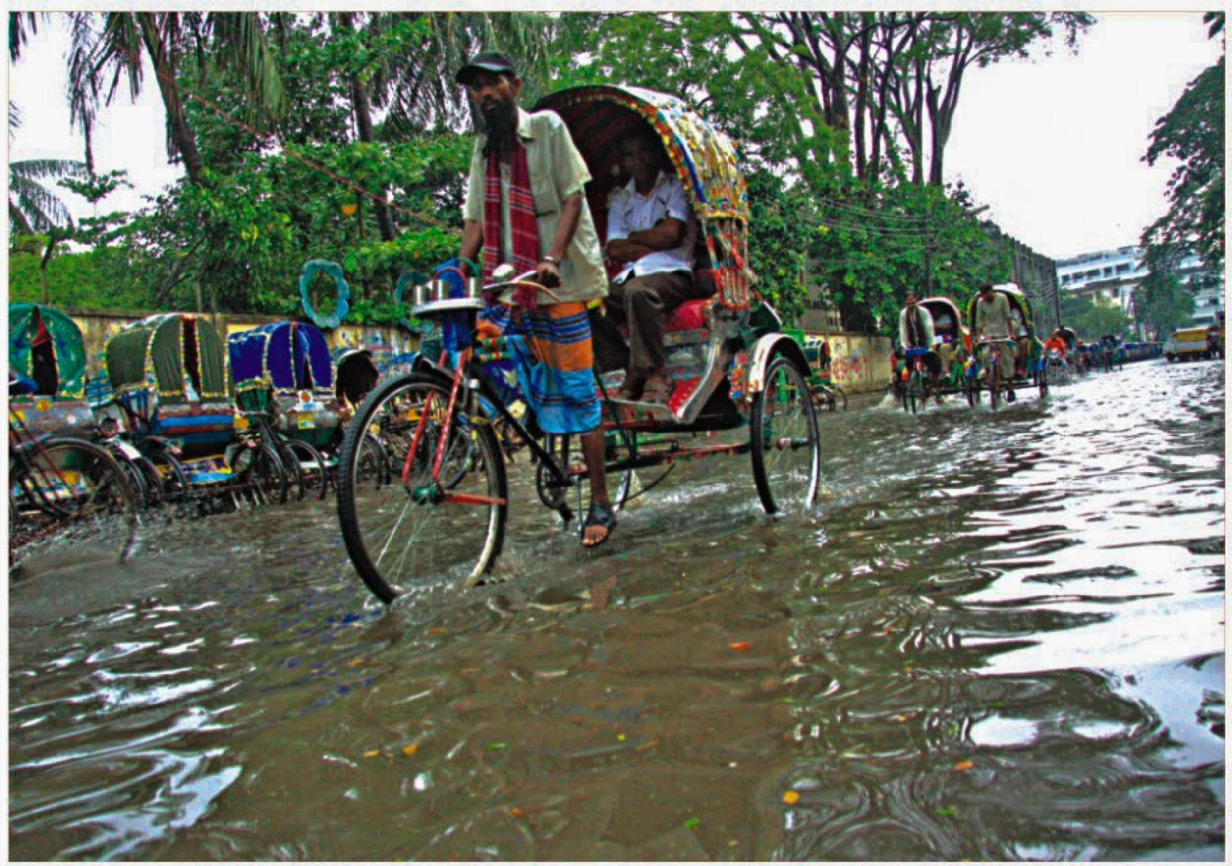
Old Secretariat Road at Nimtali in the city went under water after rain yesterday afternoon.

Bangladesh is the world's third-largest garment exporter after China and Turkey with export shipments surging more than 40 percent to $15 billion over the last 10 months.