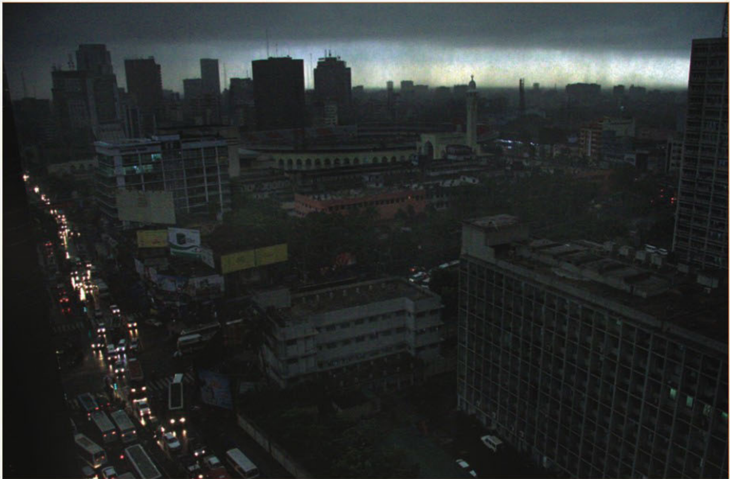
This photo, taken from Purana Paltan intersection 25 minutes to yesterday noon as a nor'wester lashes the capital, could easily be mistaken for a photo taken in the evening with the dark sky, glowing horizon and vehicles travelling with their headlights on.