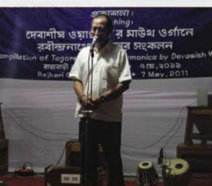
Chakma Raja Devasish Roy at the programme.

About Rabindranath, the Chakma Raja said that the poet lives in the hearts of people for his outstanding literary contribution. "I tried my level best to demonstrate the unique beauty of Rabindra Sangeet through mouth organ, and I will try to do even