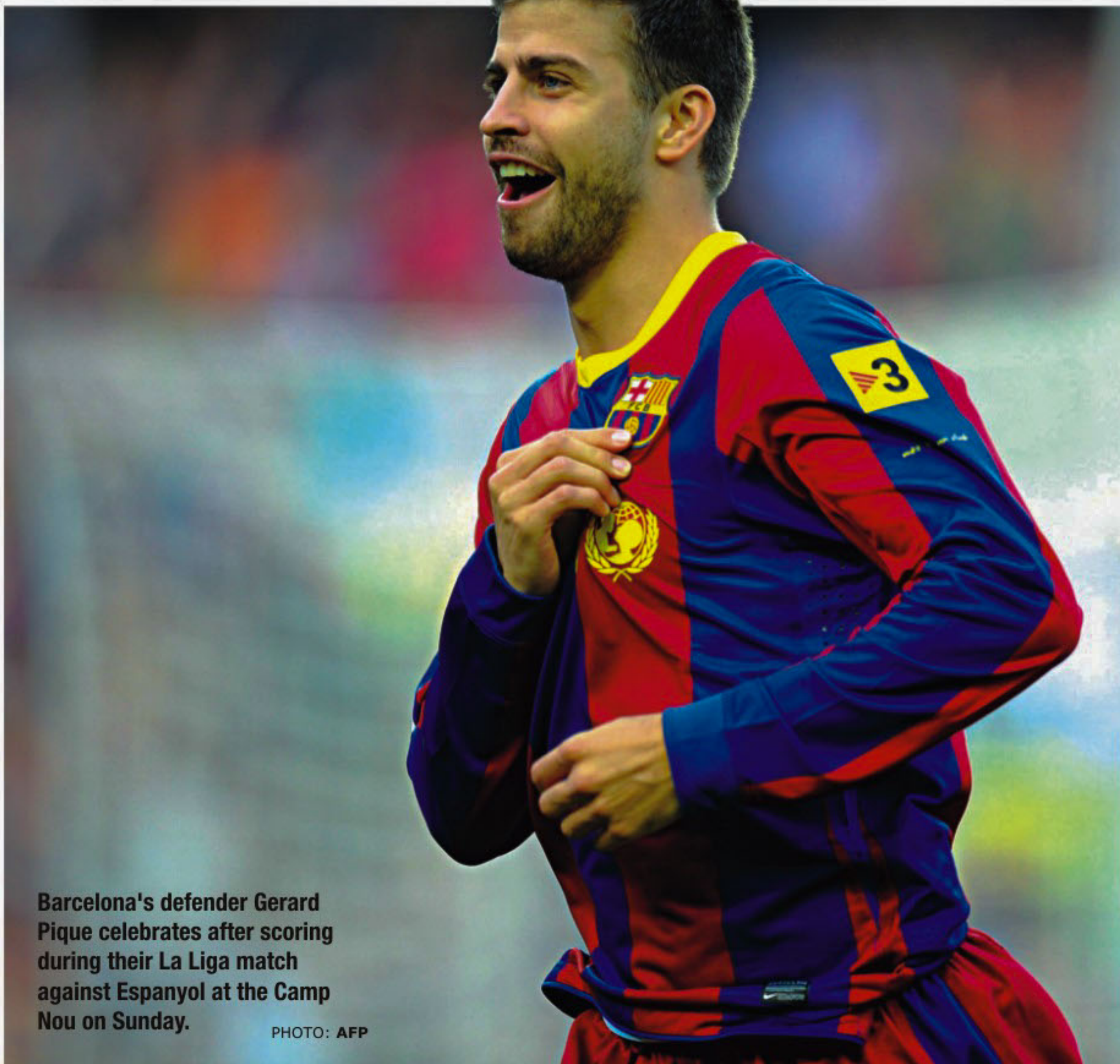
Barcelona's defender Gerard Pique celebrates after scoring during their La Liga match against Espanyol at the Camp Nou on Sunday.

Hercules' future is also looking bleak as they are now six points from safety following a 3-2 defeat at home by Racing Santander