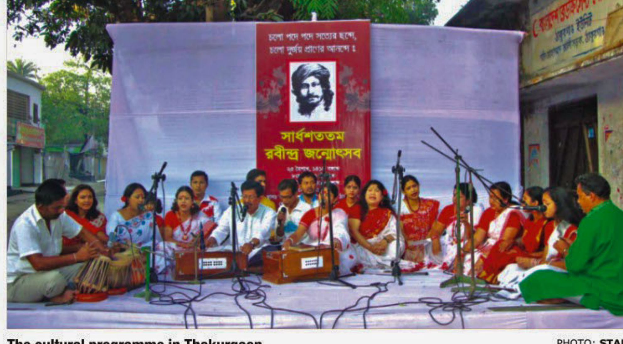
The cultural programme in Thakurgaon.