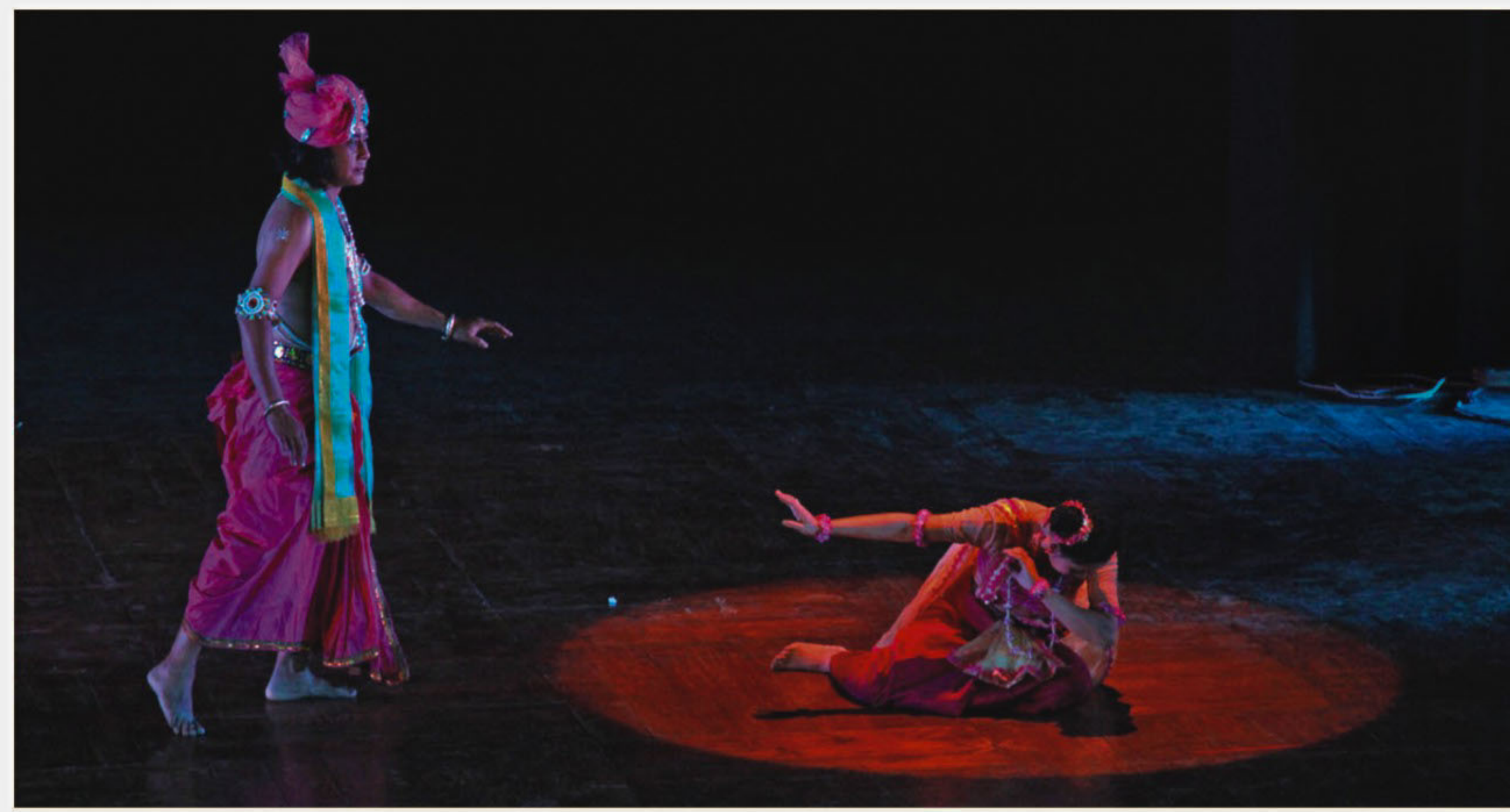
When her pleas fall upon deaf ears, Devayani curses Kacha: "A bearer of burdens you will become hereafter, and futile will be your efforts to use the art you have learnt."