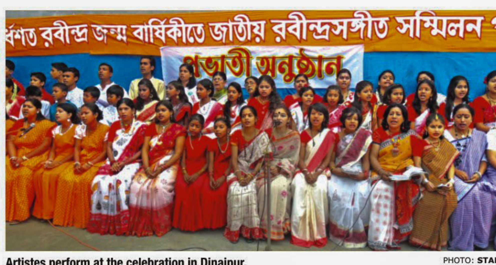
Artistes perform at the celebration in Dinajpur.