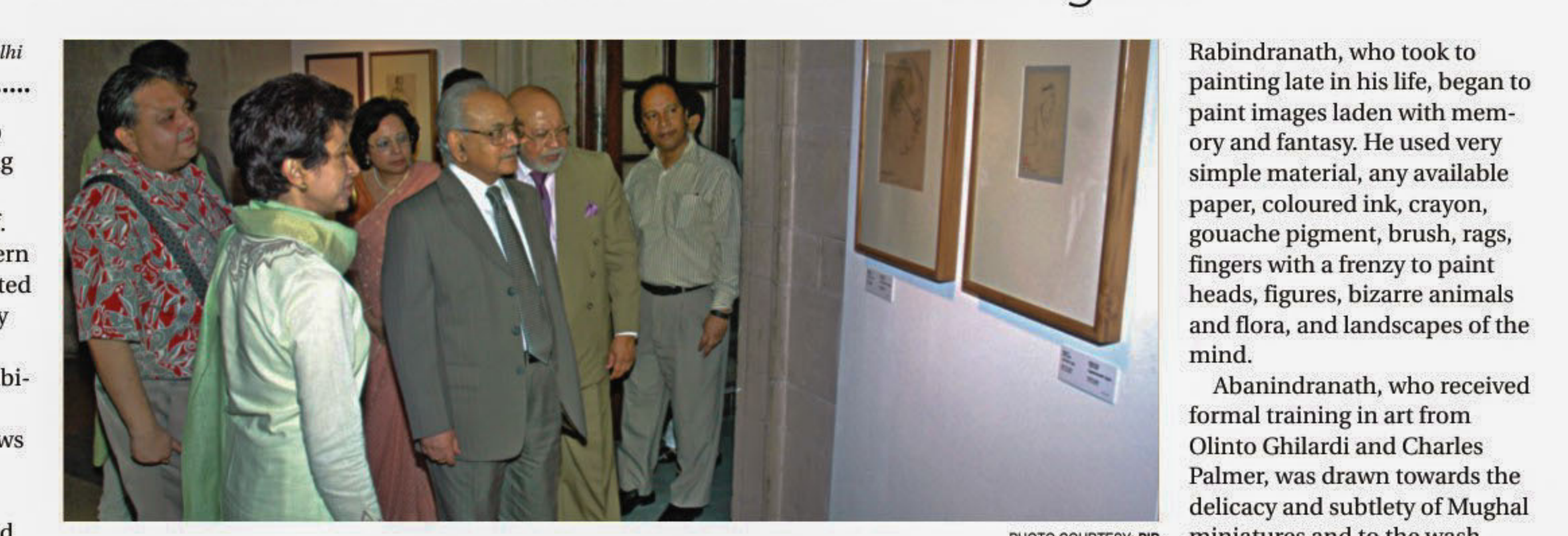
The Union Minister for Housing and Urban Poverty Alleviation and Culture, Kumari Selja and the Planning Minister of Bangladesh, Air Vice Marshal (Retd.) A.K. Khandker going round the exhibition.

painters had worked, their individual temperaments and search for a new visual language, using among other genres, fantasy, mystery and romanticism. The evolving political, social and cultural identity of India at that time had a profound impact on the Tagore family of Jorasanko in north Kolkata. Added to this ferment, was the influence of the awakening national consciousness. From 1928 onwards,