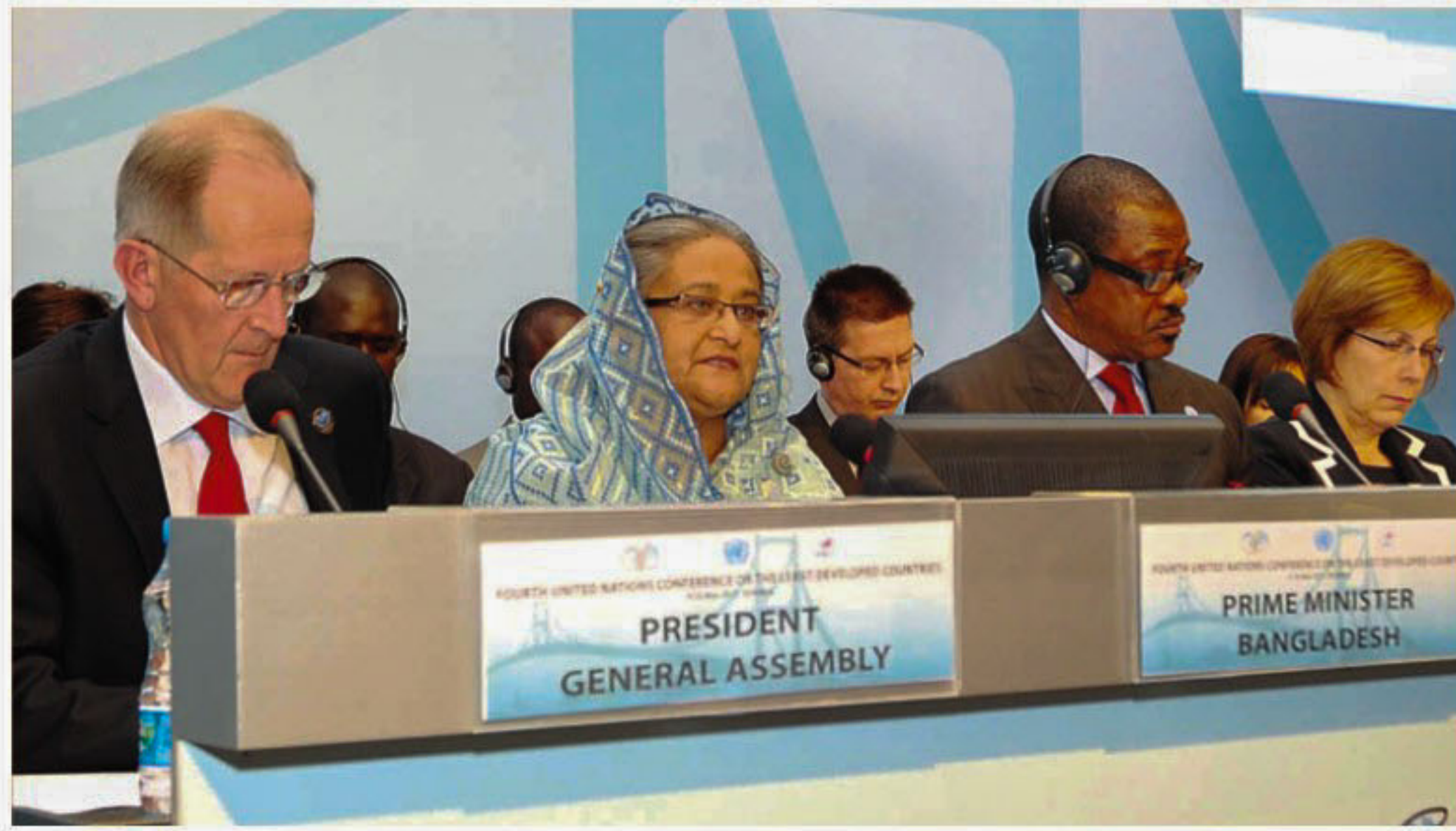
Prime Minister Sheikh Hasina attends a session of the UN summit with 48 leaders of the world's Least Developed Countries (LDCs) in Istanbul yesterday. Story on page 20.

SEE PAGE 7 FOR 'US WANTS ACCESS TO OSAMA'S WIVES'