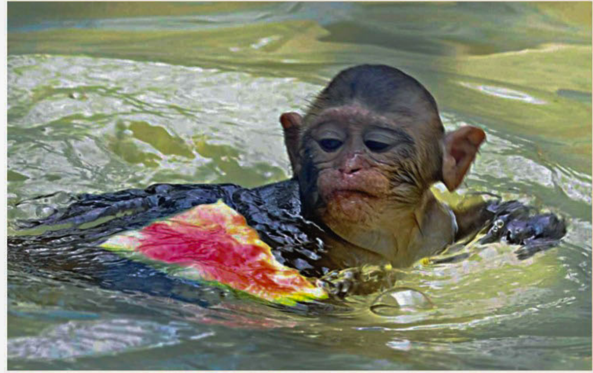
Monkeys trying to cool off in a pool of Dhaka Zoo during the heatwave on Saturday. However, last night's rain came as a relief for the city dwellers who suffered an unusual hot weather for a few days.