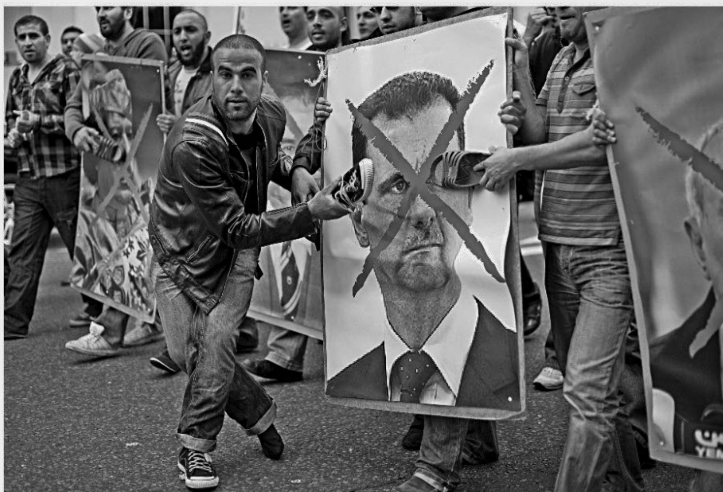
Protestors hit posters of Syria's President Bashar al-Assad (R) and Libyan leader Muammar Gaddafi with shoes during a demonstration outside the Syrian embassy in London on Saturday.

Turkey's role as host highlights its strategic position linking the European and Asian continents, as well as its expanding regional profile and robust economic growth.