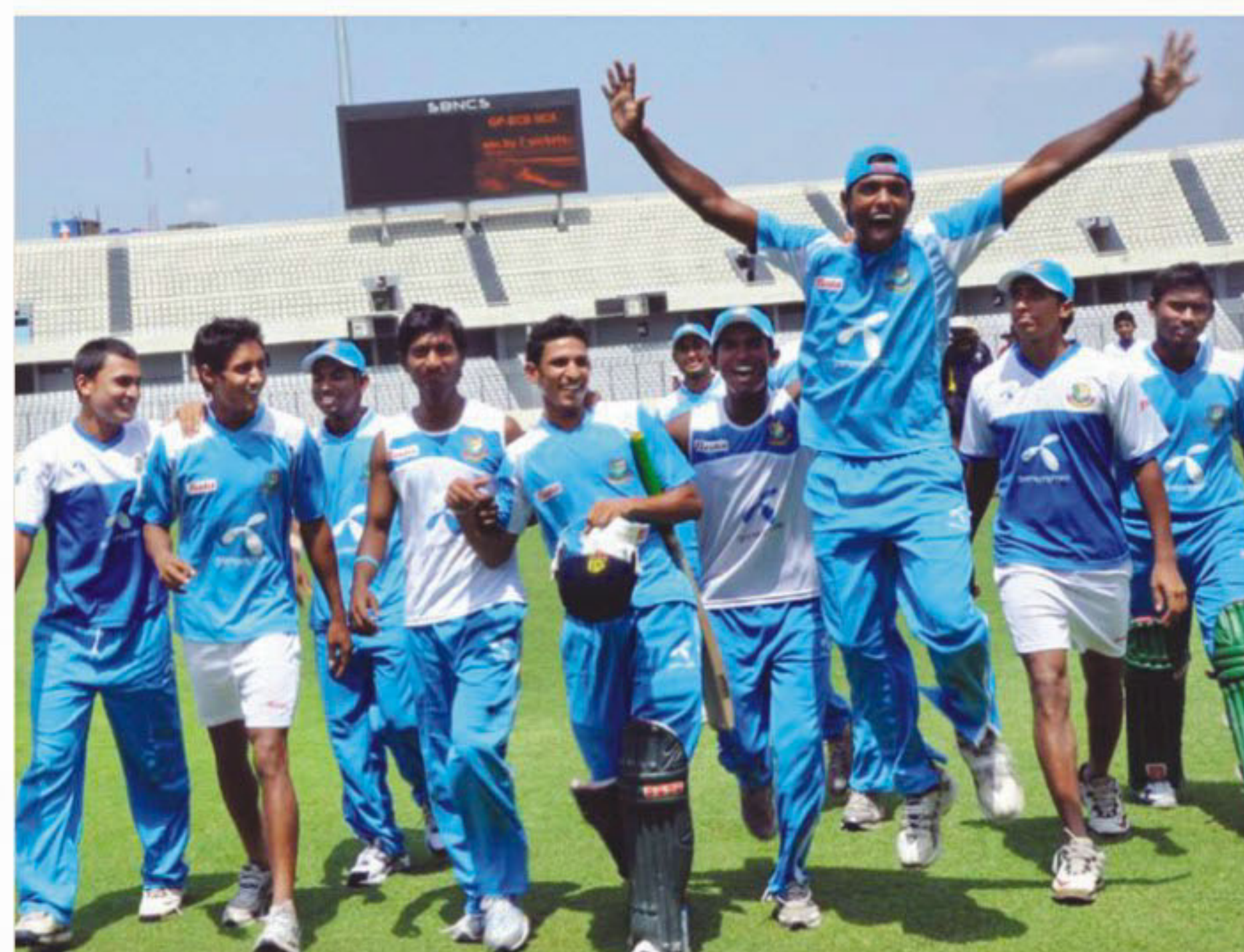
GP-BCB National Cricket Academy players rejoice after they clinched the two-match Twenty20 series against South Africa Cricket Academy at the Sher-e-Bangla National Stadium in Mirpur yesterday.