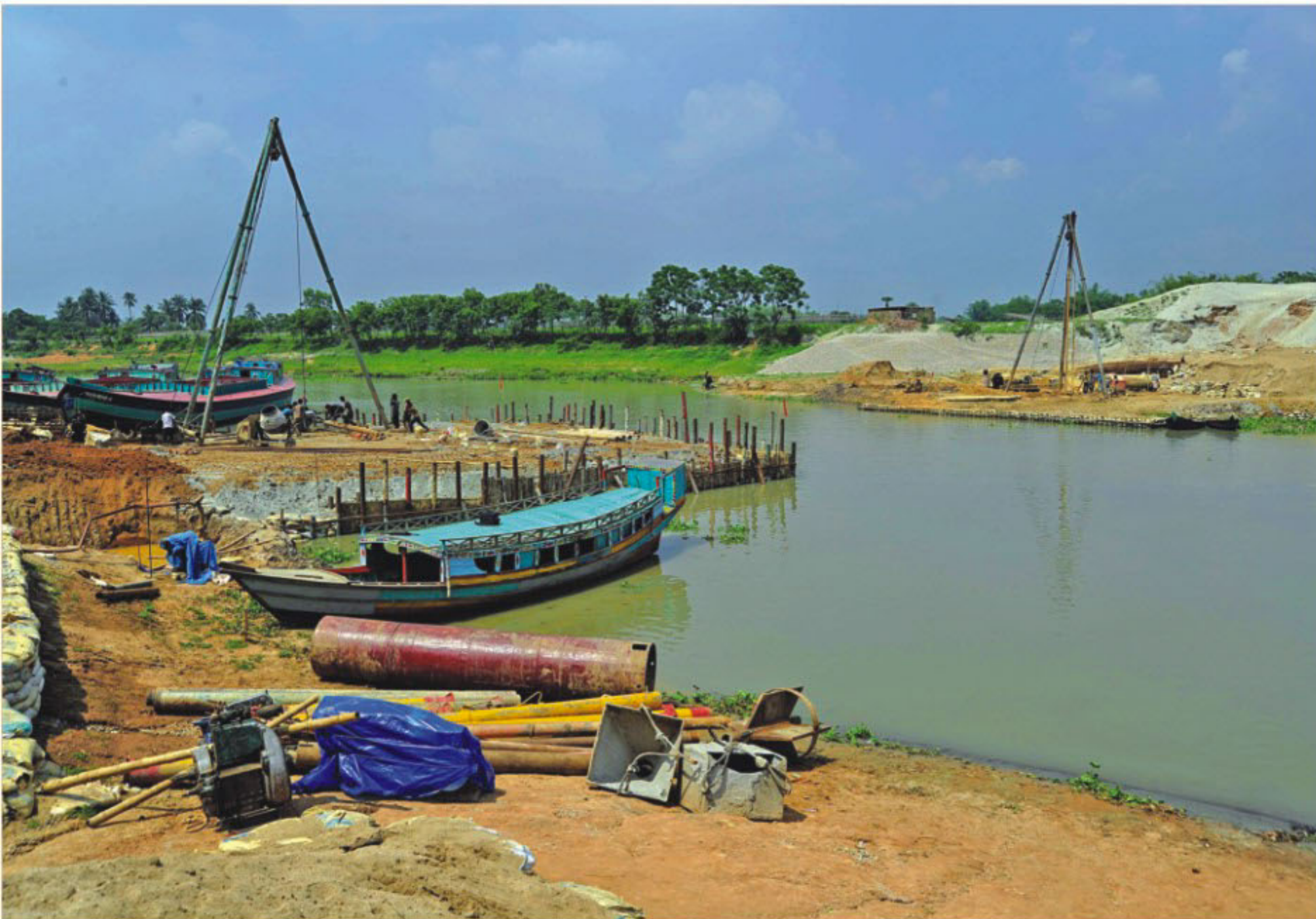
Almost two-thirds of the Balu river at Mashkul in Khilkhet has been filled up by Rajdhani Unnayan Kartripakkha to build a bridge. However, the Department of Environment has stopped the construction after The Daily Star ran a report on the issue yesterday.

The statement was issued after a meeting SEE PAGE 19 COL 5