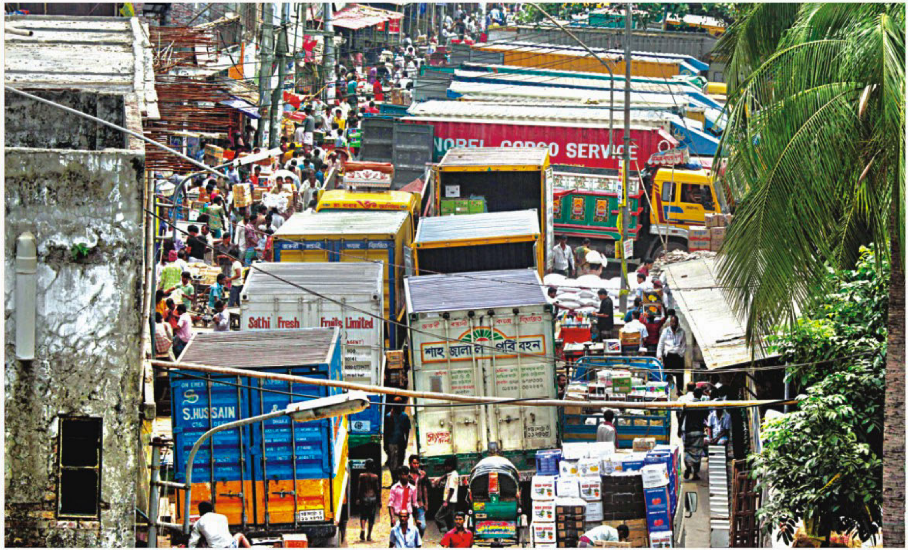
Haphazardly parked fruit-laden trucks on Ahsanullah Road near Badamtoli in Old Dhaka hinder movement of pedestrians and vehicles. The photo was taken yesterday.