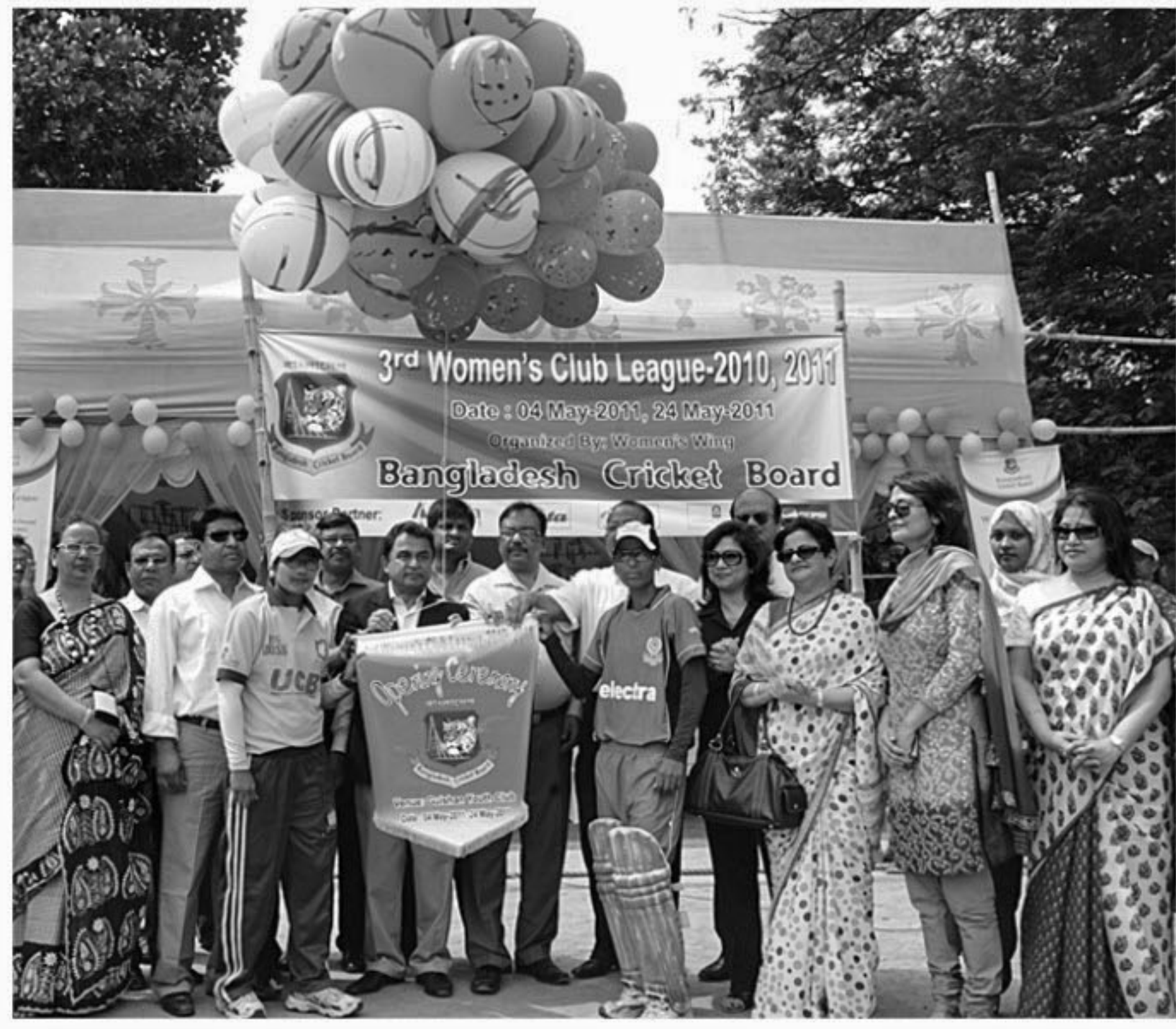
Organisers and participants pose for a photo at the launch of the 3rd Women's Club Cricket League at the Gulshan Youth Club yesterday.

Result: Chennai Super Kings won by eight wickets. Man-of-the-match: Michael Hussey.