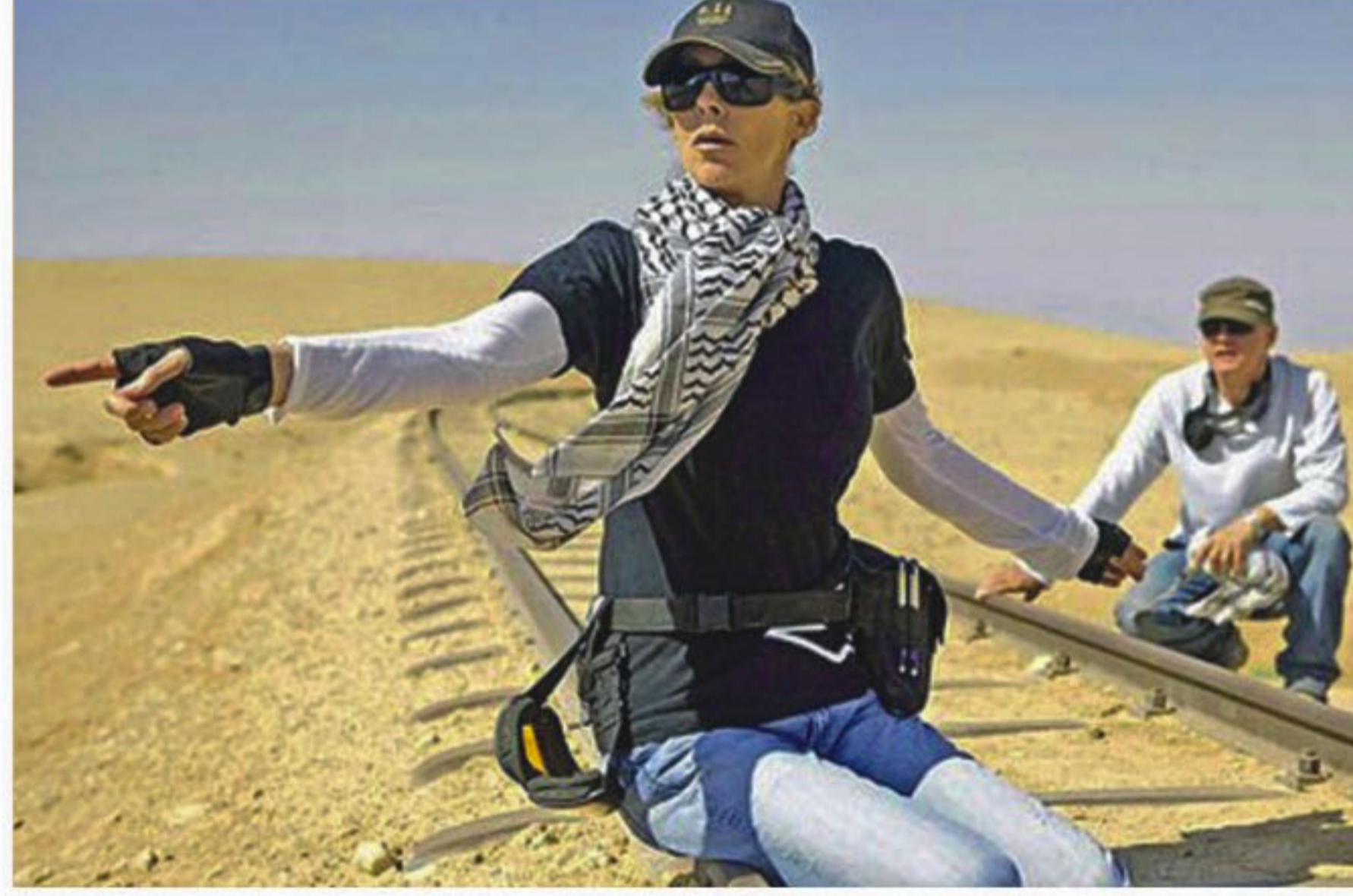
Director Kathryn Bigelow has a project in the works about Osama bin Laden.