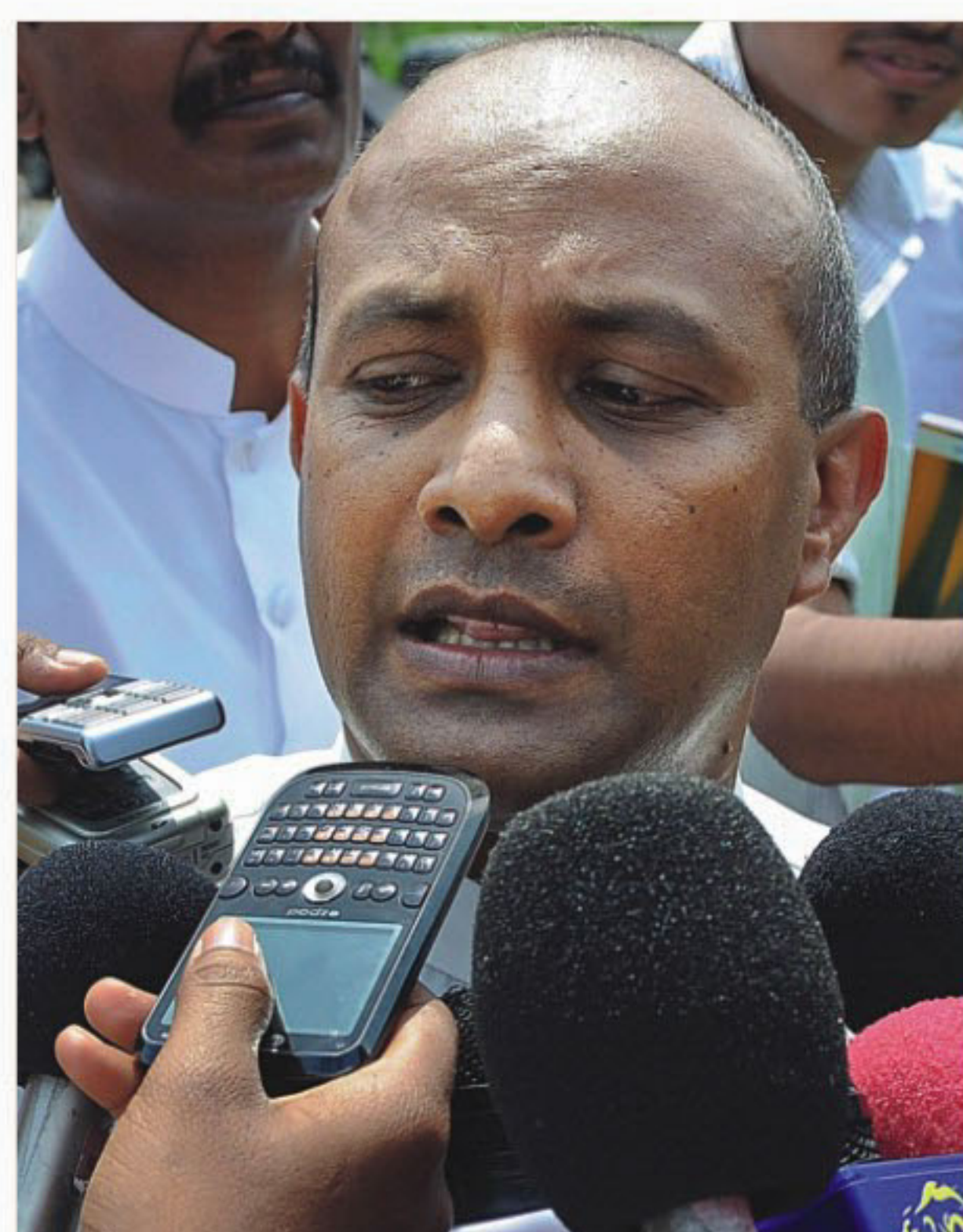
I PREDICT A RIOT: Former Sri Lankan cricket captain Hashan Tillakaratne speaks to the media in Colombo yesterday. The former left-handed batsman said that he will share information on matches fixed during his career with the ICC.

Tillakaratne's allegations have raised a storm, with former skipper Kumar Sangakkara challenging him to prove his claims. "It's interesting to see what he has to say and if he has anything more than allegations," said Sangakkara, who quit as captain after Sri Lanka's defeat to India in the World Cup final. "It's dangerous to throw names around."