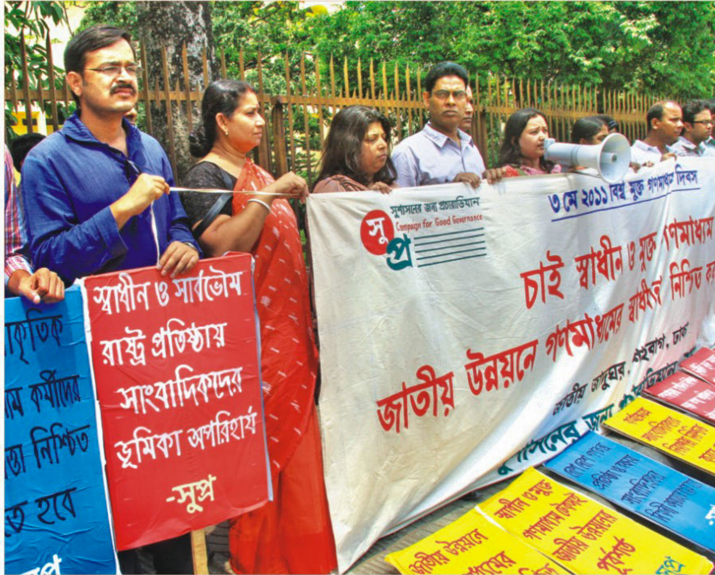
Sushasoner Jonno Procharavizan (Campaign for Good Governance) forms a human chain in front of the National Museum in the city yesterday marking the World Press Freedom Day.

Speakers at the programme said although a democratic government is in power now, many journalists were being killed and harassed, making the country as one of the top countries in terms of repressing journalists. The culture of repression on media and journalists is not good for democracy, they said, demanding the government ensure freedom of press and security of journalists. The United Nations General Assembly declared May 3 as World Press Freedom Day to raise awareness of the importance of freedom of the press. The day is also to remind governments of their duty to respect and uphold the right to freedom of expression enshrined under Article 19 of the Universal Declaration of Human Rights, according to the wikipedia.