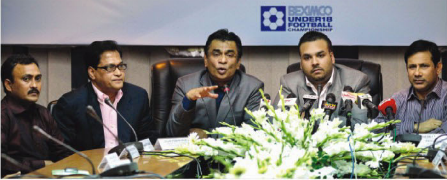
BFF president Kazi Salahuddin (C) celebrates the completion of his third year in office by confirming the international friendly match between Argentina and Nigeria in Dhaka on September 6 in a press conference at the BFF House yesterday.

Venue: Bangladesh Football Federation Date: 30 April 2011