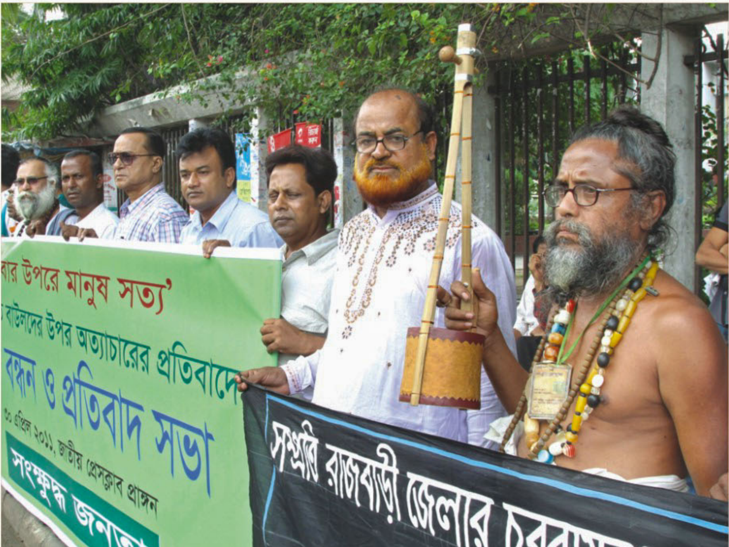
Sangkhubda Janata, an organisation of the agitated people, forms a human chain in front of the Jatiya Press Club in the city yesterday protesting recent attack on the bauls (mystic devotees) in Rajbari.