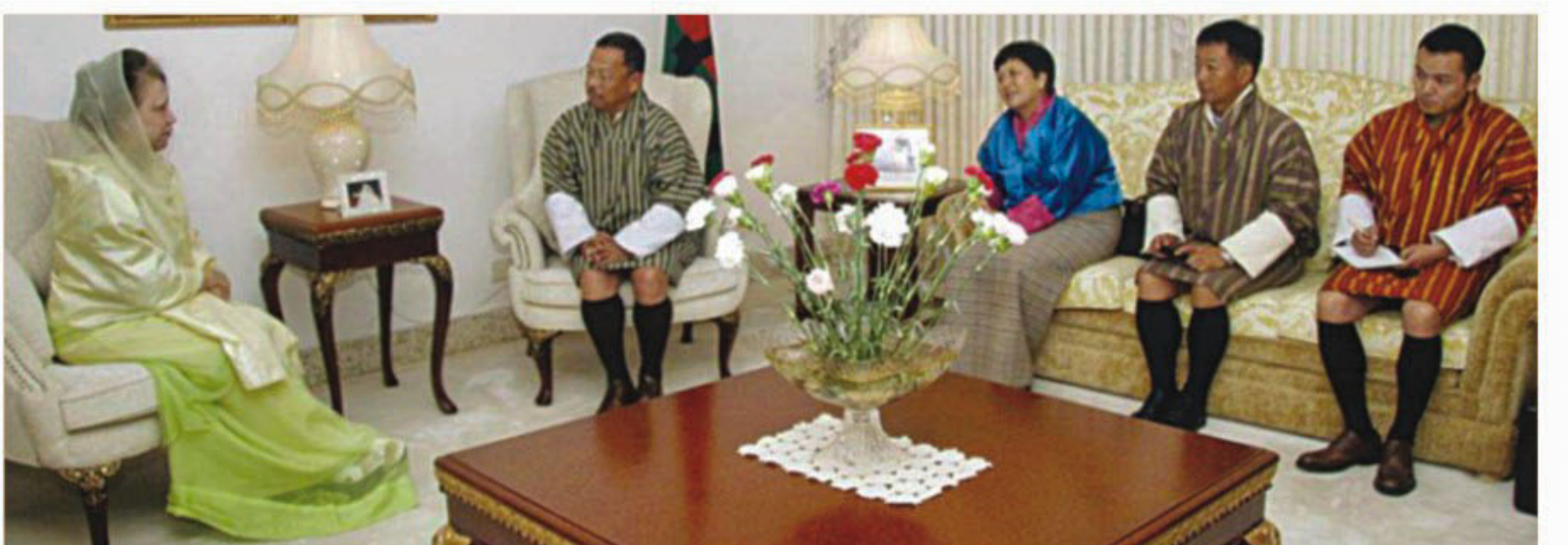
Speaker of the National Assembly of Bhutan Lyonpo Jigme Tshulthim calls on BNP Chairperson Khaleda Zia at her Gulshan office in the city yesterday.

A book on Kalyanpur mass killing was launched at the programme.