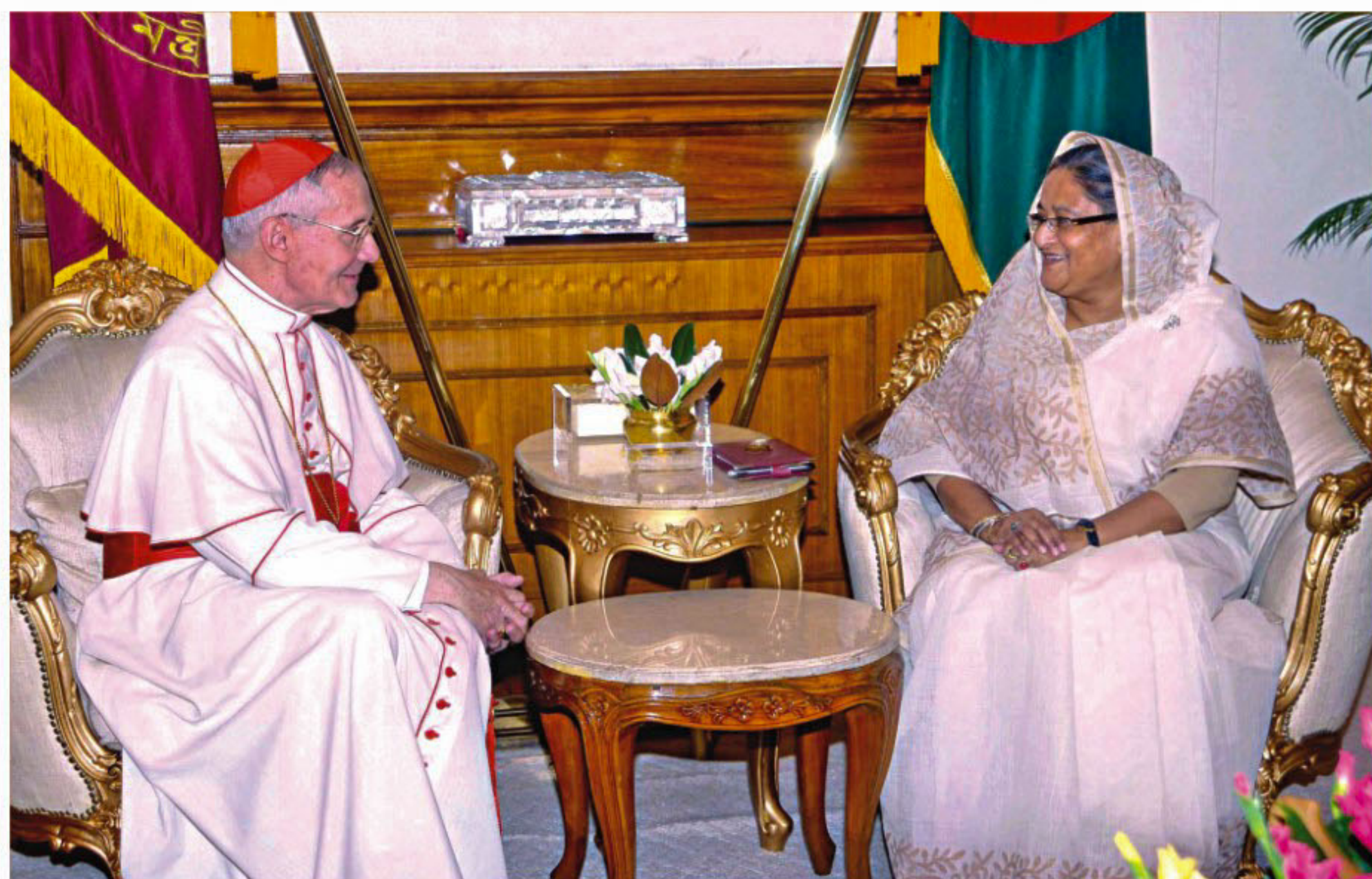
Cardinal Jean-Louis Tauran, currently serving as the president of the Pontifical Council for Interreligious Dialogue in the Roman Curia, calls on Prime Minister Sheikh Hasina yesterday. Story on page 2