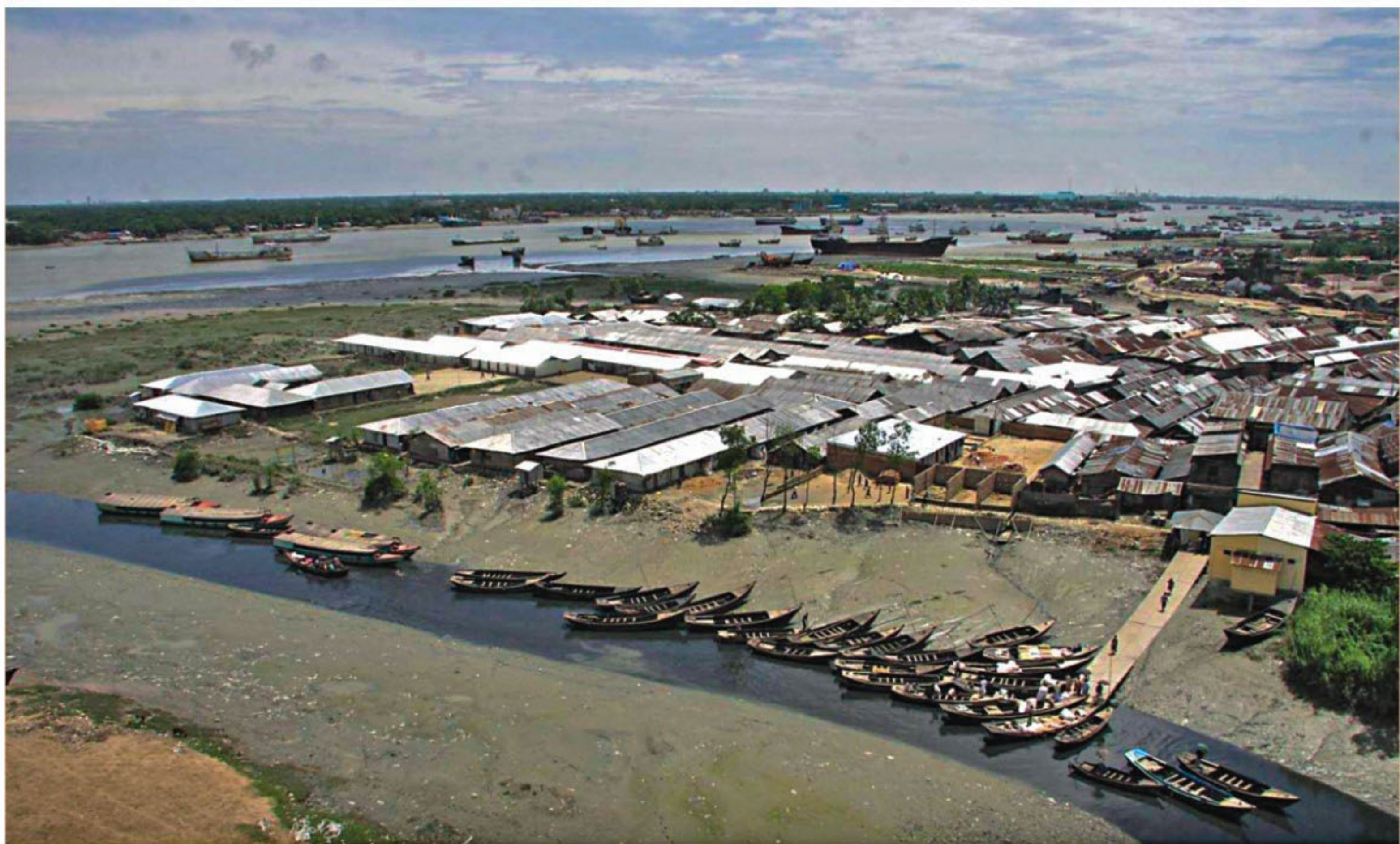
Land grabbers have set up tin-roofed houses on a char in the Karnaphuli river in Chittagong. Lack of large-scale dredging has led to the surfacing of such large chars in the river.