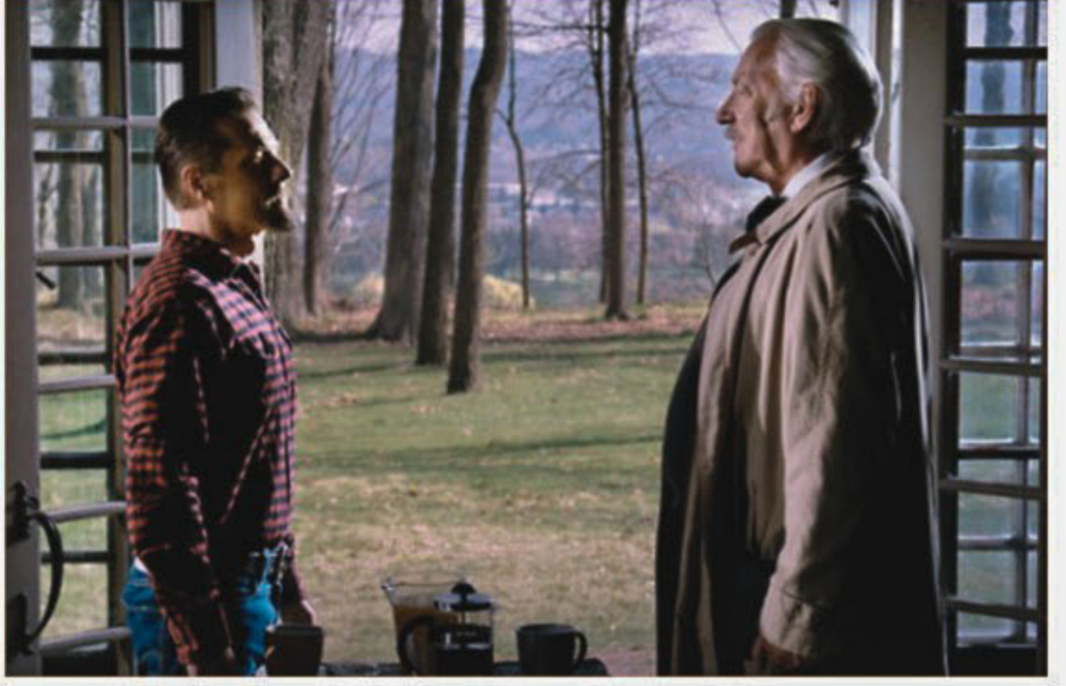
Mullen Jr (left) stars opposite Donald Sutherland in the drama, a remake of a French film from 2002.