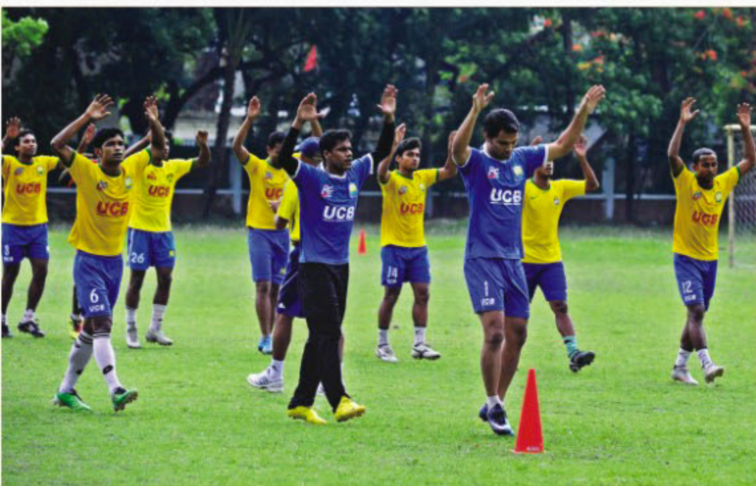
Players of Sheikh Jamal Dhanmondi Club (L), at the BUET Ground, and Abahani (R), at the Mohammadpur Mina Bazar Ground, go through their training regimes yesterday, ahead of locking horns in the first match of the second leg of the Bangladesh League at the Bangabandhu National Stadium today.