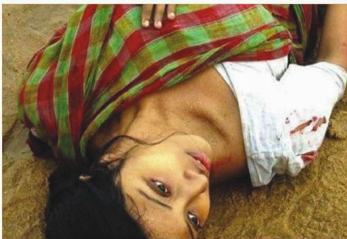
A scene from "Chatrak".