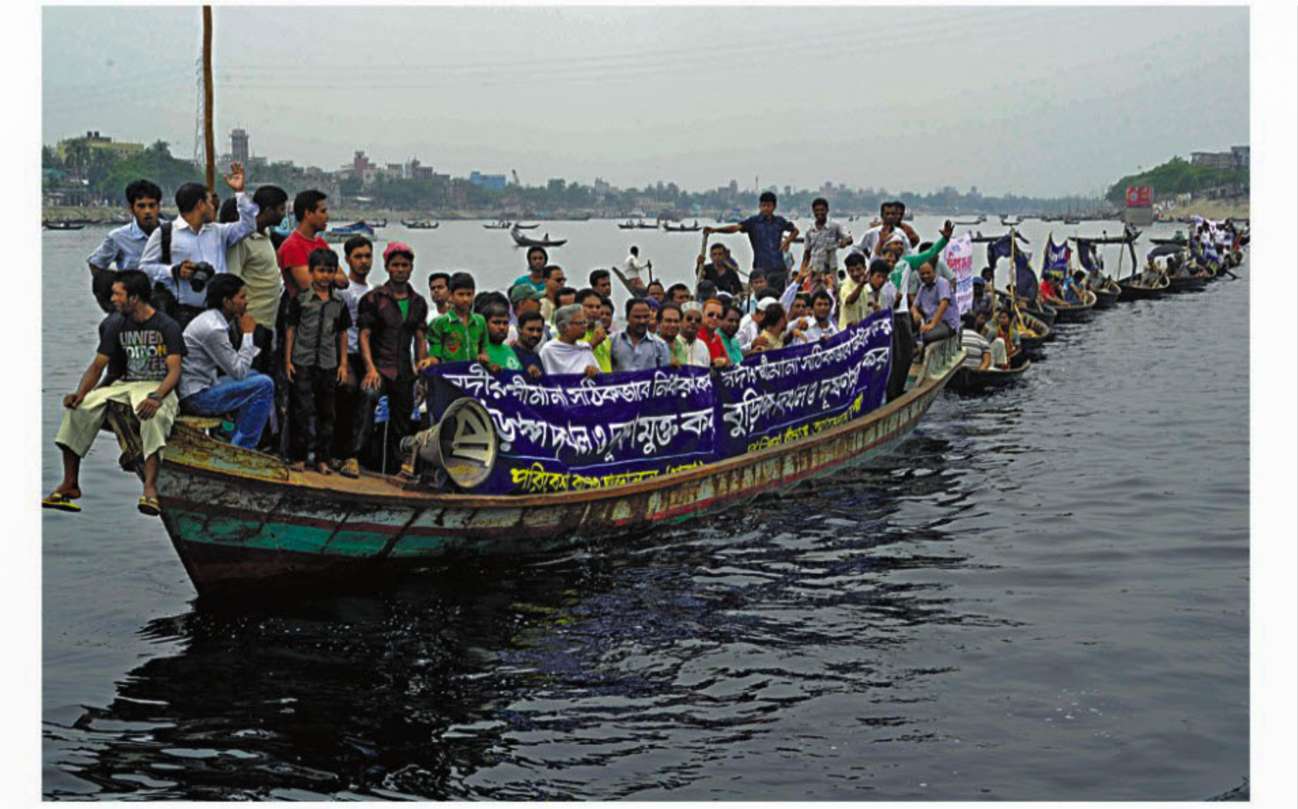
Bangladesh Paribesh Banchao Andolan brings out a boat rally on the Buriganga near Weisghat yesterday demanding the river be demarcated properly and made free from pollution and encroachment.