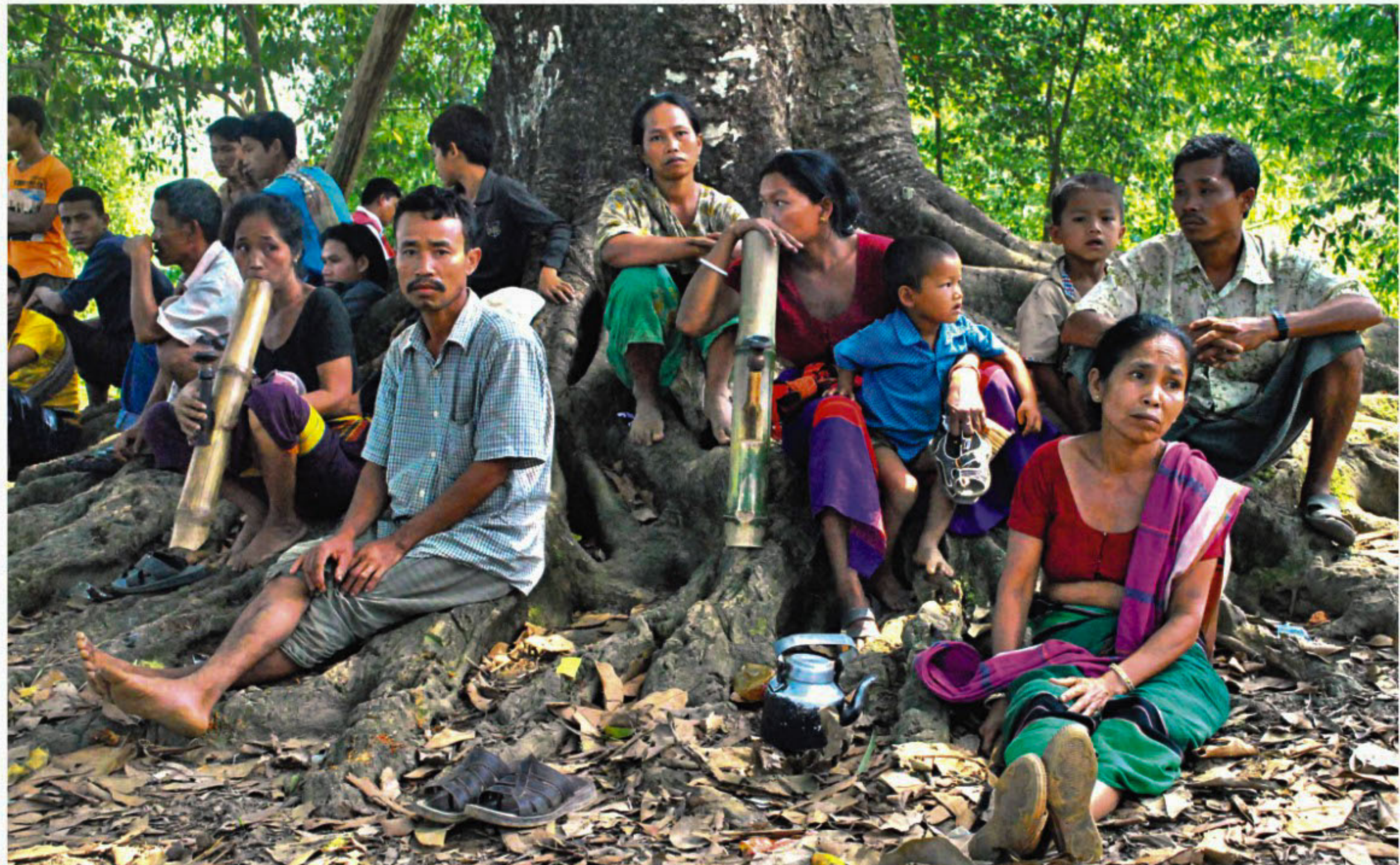
These indigenous people have taken shelter under a tree as their houses were burnt to ashes in the last week's violence over a land dispute in Ramgarh upazila of Khagrachhari. The district administration is yet to rehabilitate them.