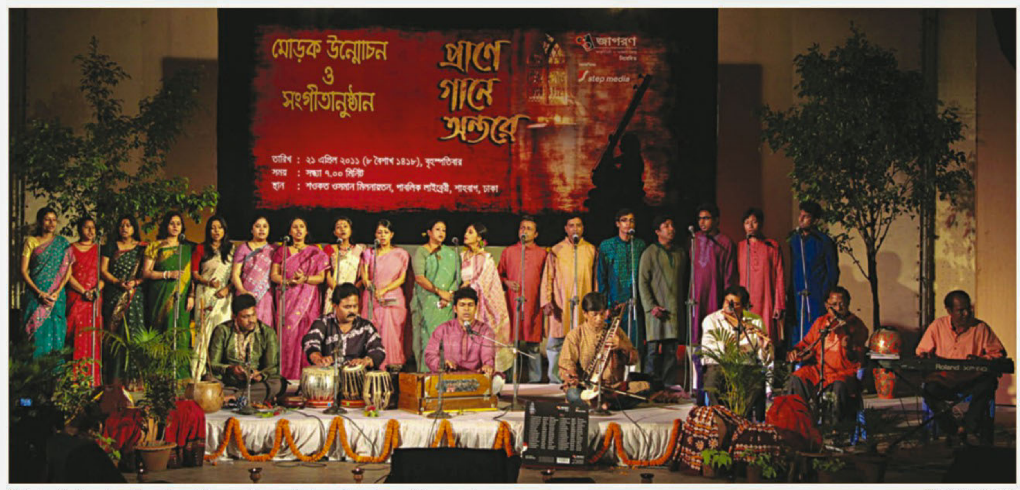
Artistes featured on the album "Praney Gaan-e Ontorey" perform at the event.

The musical soiree began with a choral rendition