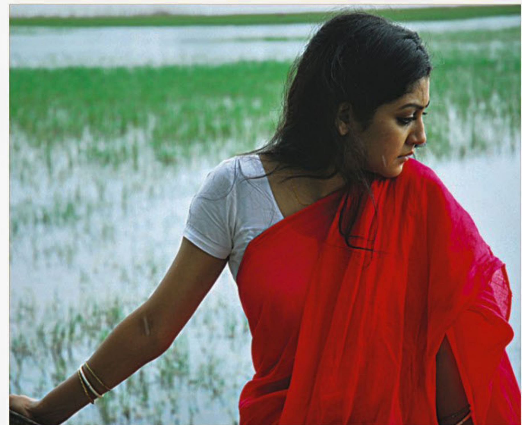
A scene from "Doob Shatar".