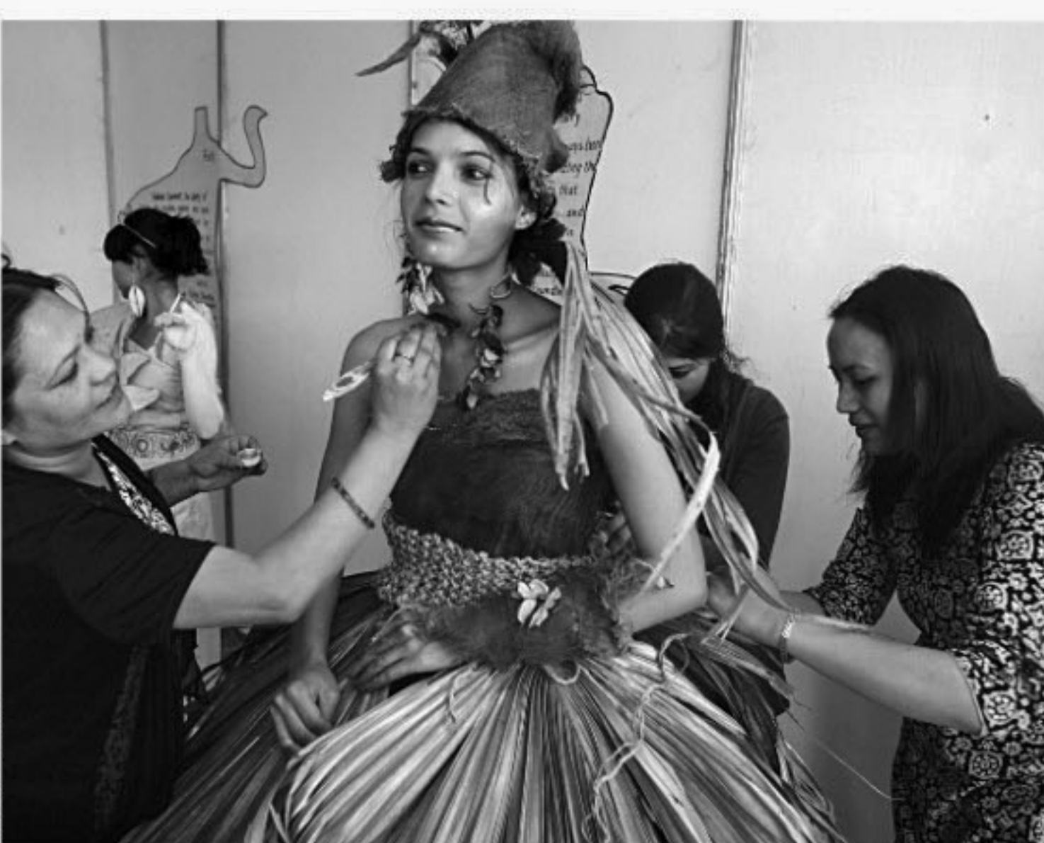
A Nepalese model gets ready to display a creation made of paper and leaves to mark Earth Day in Kathmandu yesterday. Earth Day which is celebrated on April 22 in many countries to inspire awareness of and appreciation for the earth's environment.