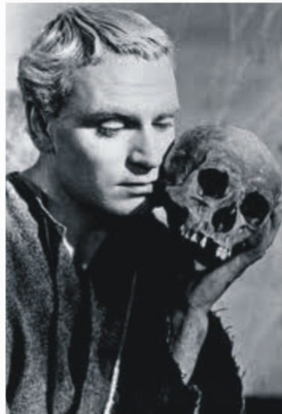
Alas, poor Yorick!

The evil in the man peeps through that well-formulated statement. Shylock is the symbol of a man under siege, at least in his view. And besieged men are prone to explosive behav-