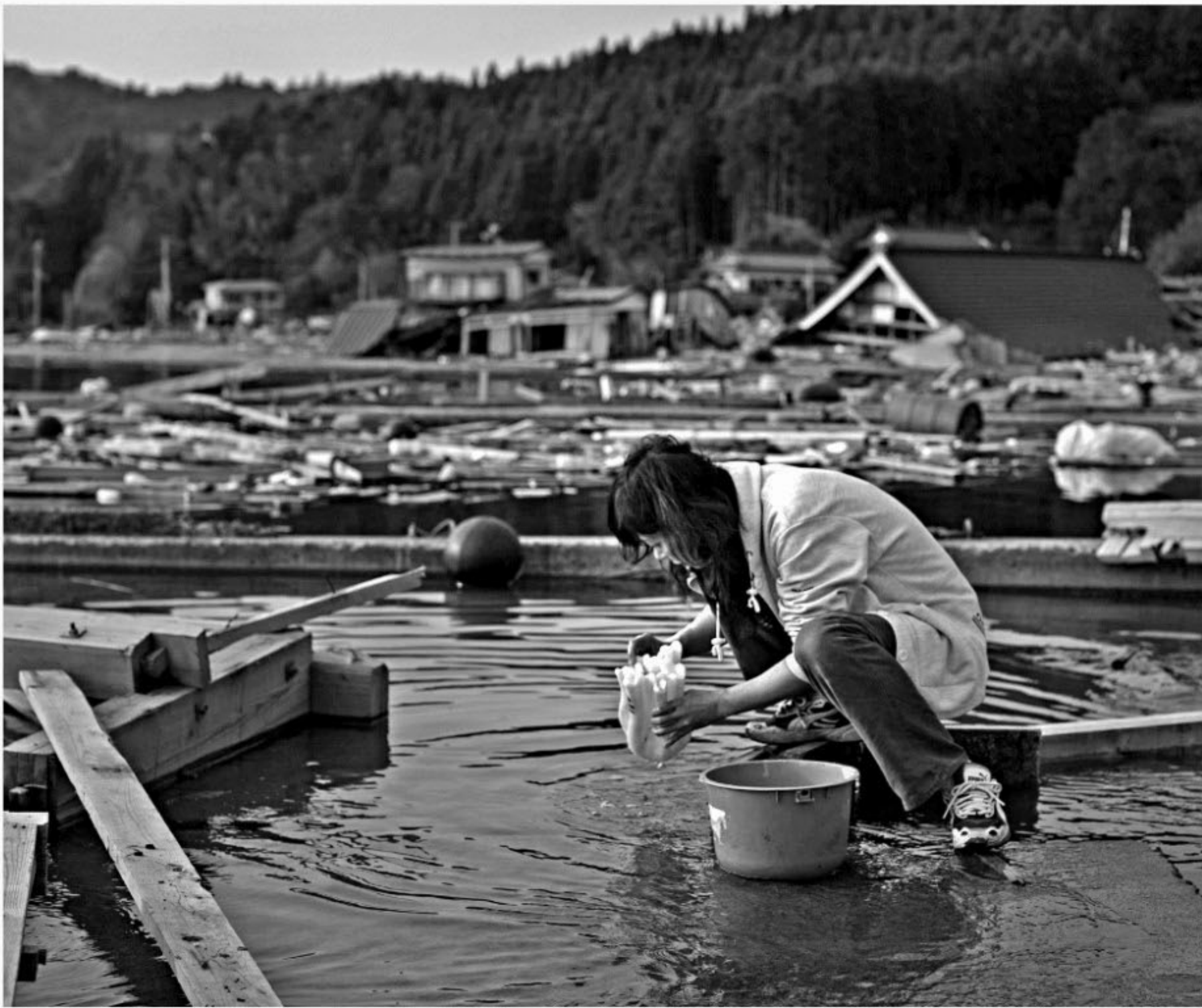
A local woman washes a few of her retrieved tableware items after the recent earthquake and tsunami at the seaport of Ogatsu town in Ishinomaki city, Miyagi prefecture yesterday.

They also said they recognised the "crucial importance of preserving the professional integrity and apolitical nature of Nepal Army" while integrating the Maoist combatants with it in line with the Comprehensive Peace Accord.