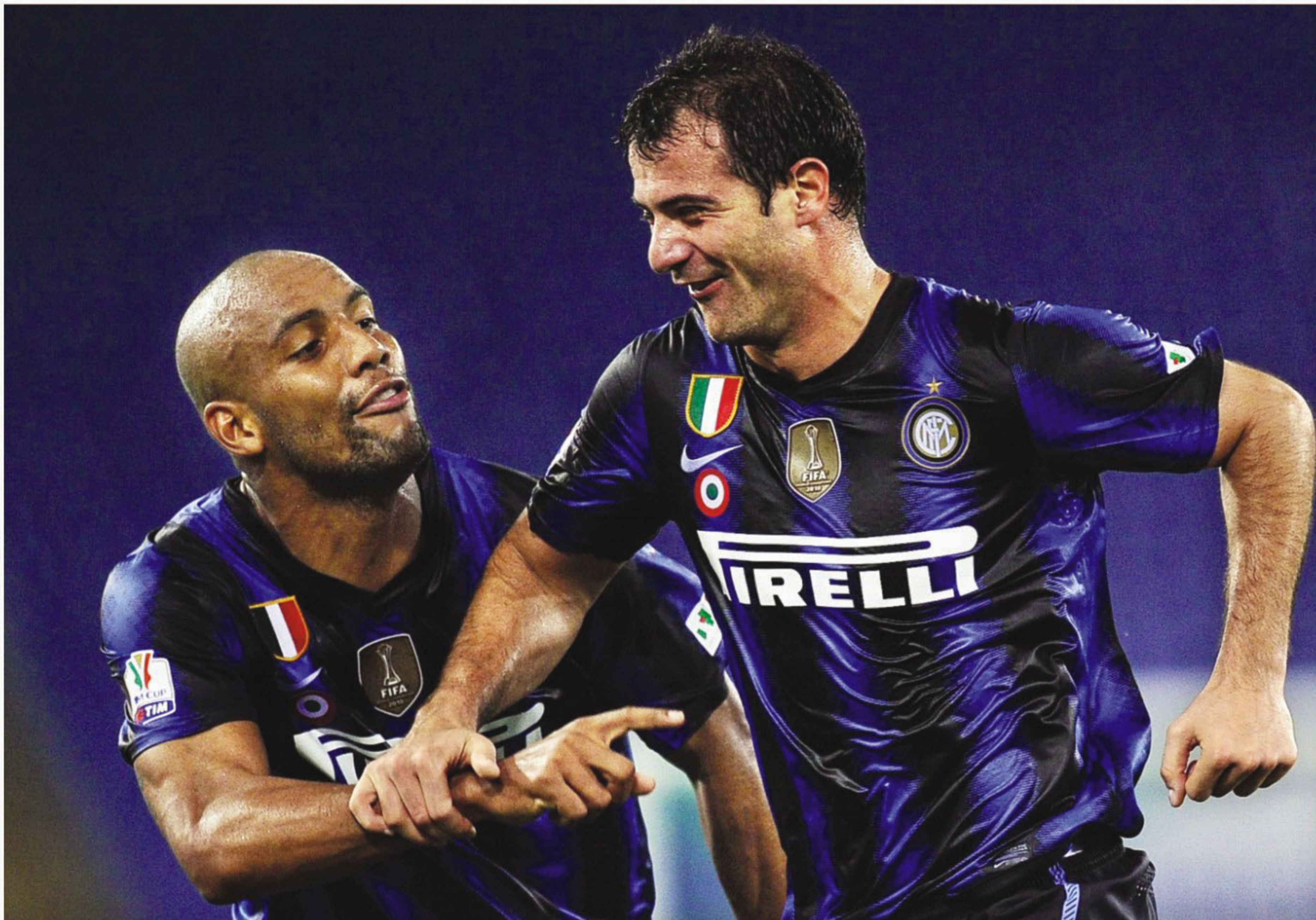
Inter Milan midfielder Dejan Stankovic (R) celebrates his stunning strike with teammate Maicon during their Coppa Italia semifinal against Roma at the Olympic Stadium on Tuesday.

Inter comfortably controlled the second period with Wesley Sneijder twice seeing shots blocked.