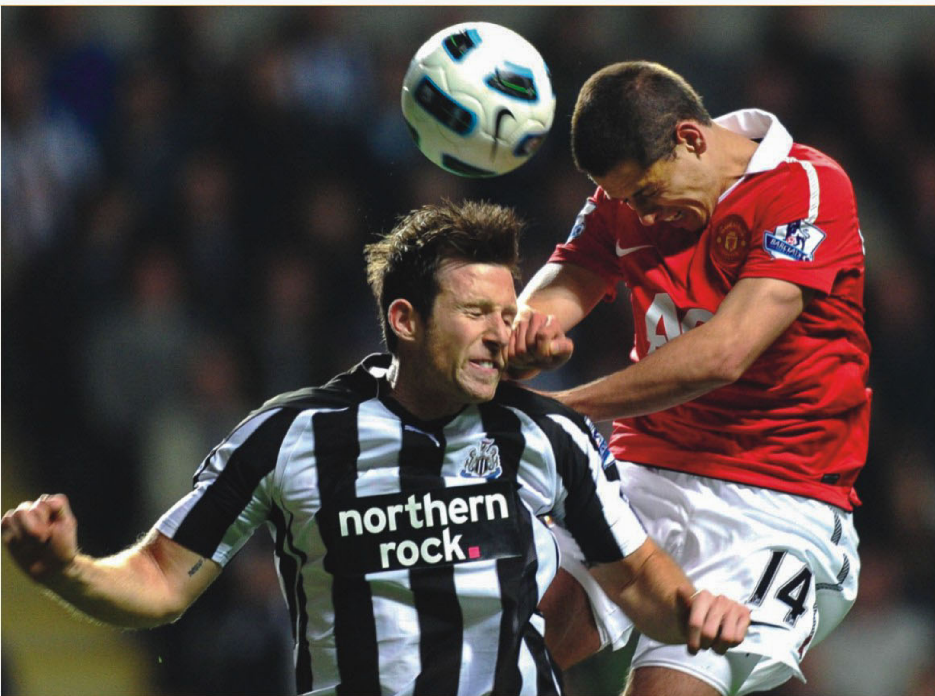
Manchester United striker Javier Hernandez (R) tussles for the ball with Newcastle United defender Mike Williamson during their Premier League clash at St James' Park on Tuesday.